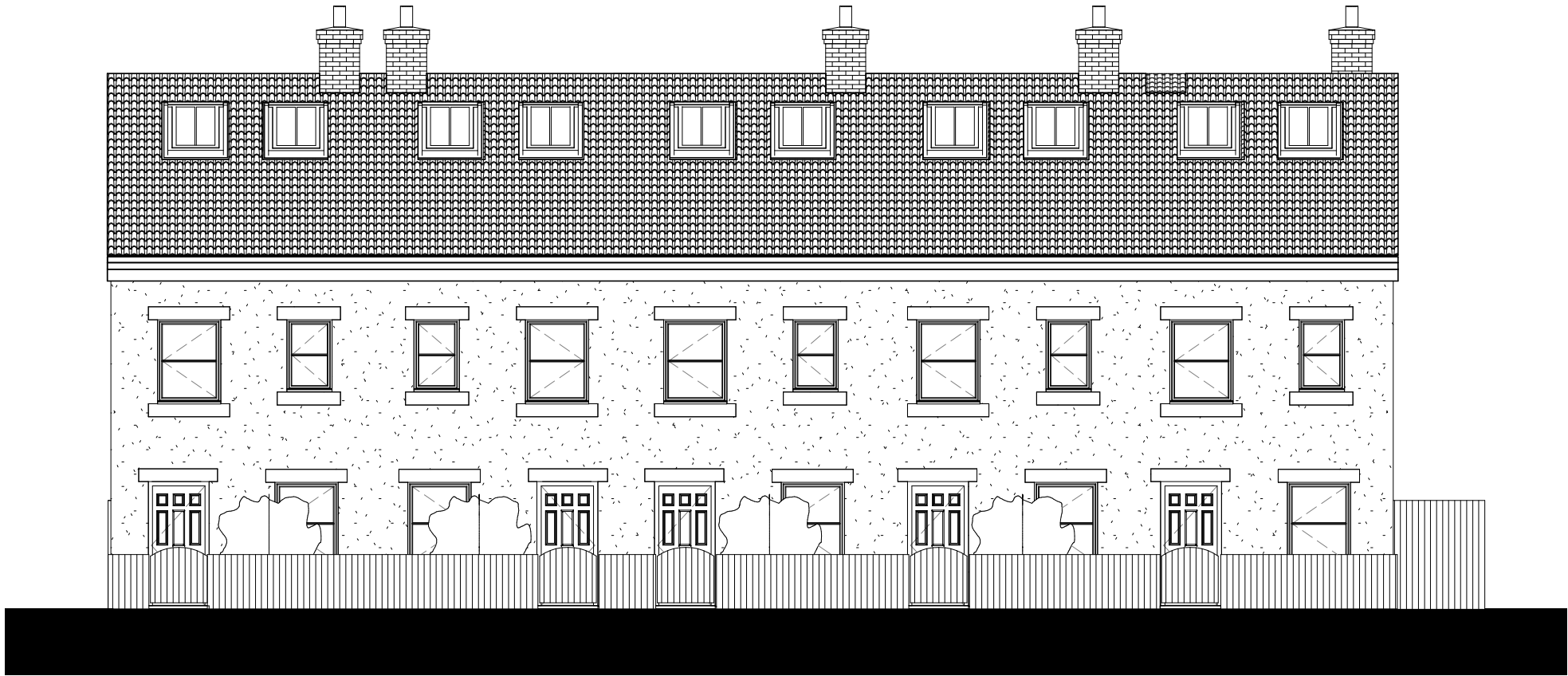
Proposed Street Scene Scale: 1:100

Copyright. This drawing and design and all the information contained therein is the sole copy right of G9 Design, and reproduction in any form is forbidden unless permission is obtained in writing. All dimensions to be checked on site. No dimensions to be scaled from this drawing. All Contractors must visit site and be responsible for taking and checking all dimensions relative to this work. The Architect must be advises of any discrepancies in writing.