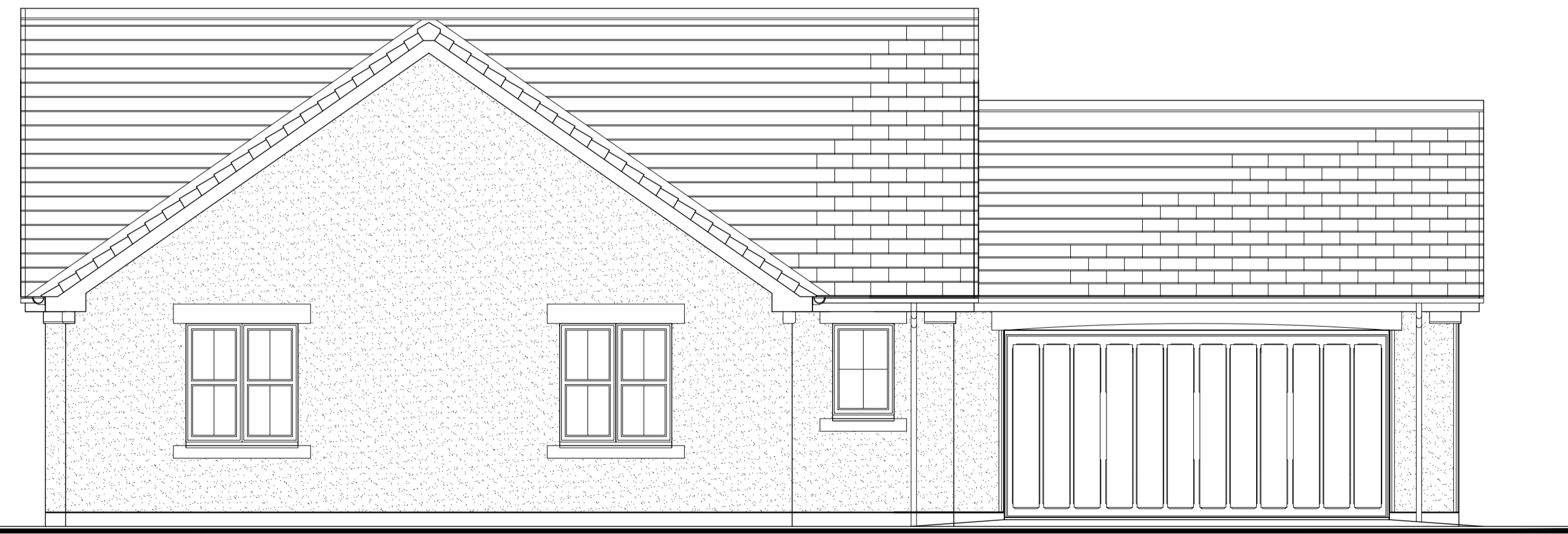
Front Elevation Scale 1:50 @ A1 / 1:100 @ A3

MANNINGELLIOTT PARTNERSHIP Chartered Architects & Designers Manelli House, Suite 1 Cooper Road, Pireth Cumbria CA11 9BN t: 01768 868 800 e: post@manning-elliott.co.uk w: manning-elliott.co.uk