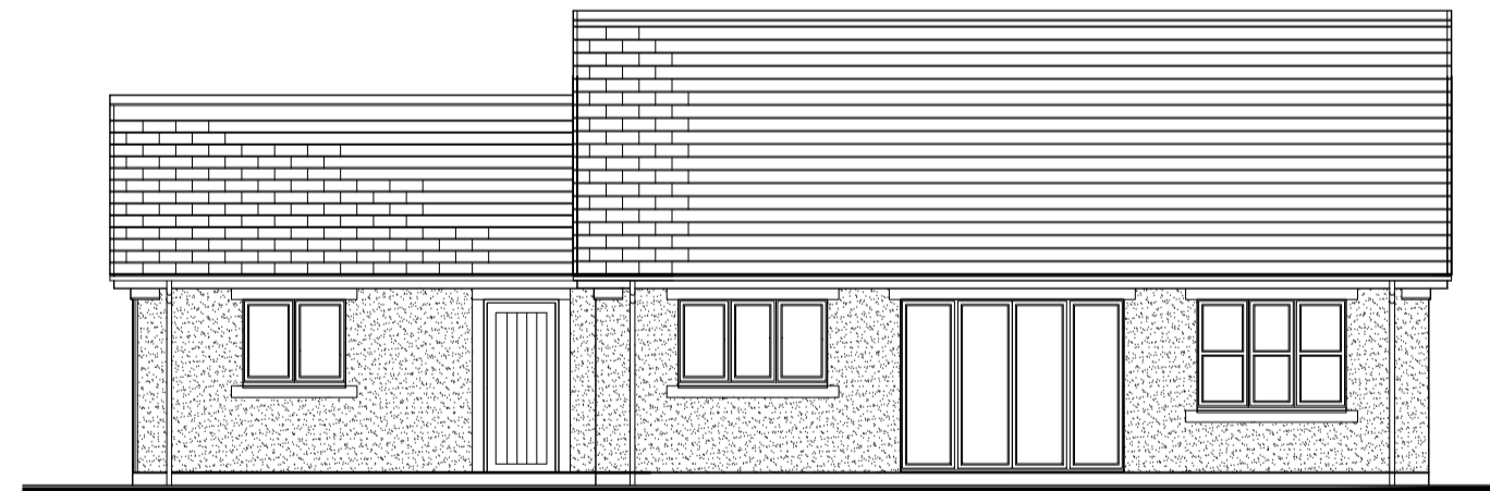
Rear Elevation Scale 1:100 @ A1 / 1:200 @ A3