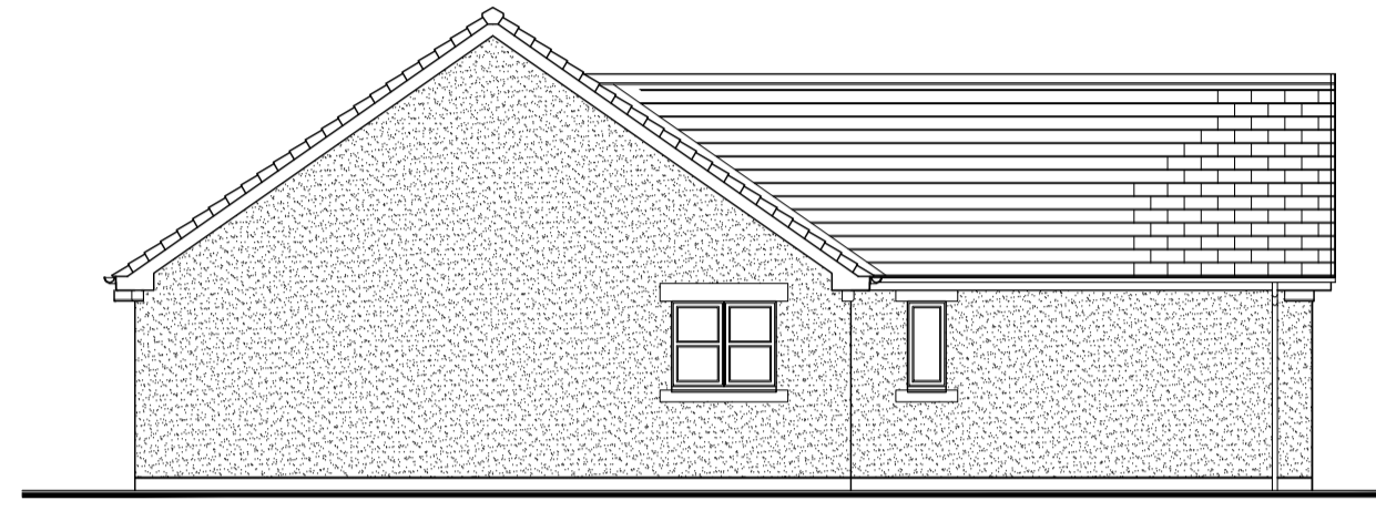
Side Elevation Scale 1:100 @ A1 / 1:200 @ A3