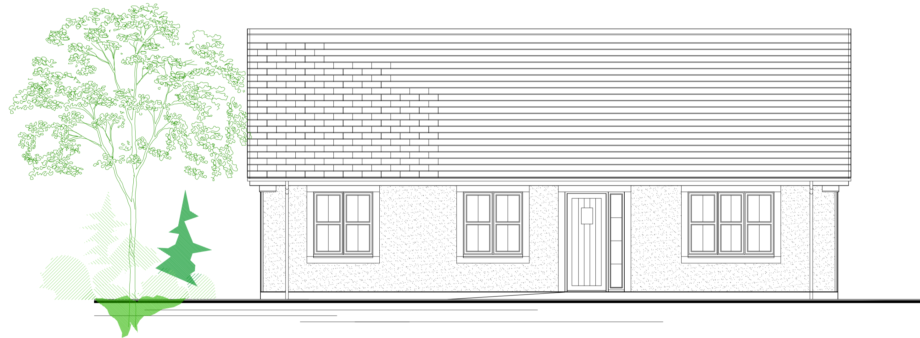
Front Elevation Scale 1:50 @ A1 / 1:100 @ A3