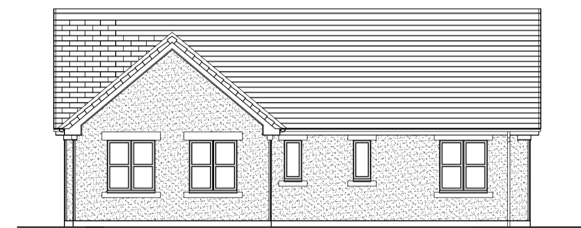
Side Elevation Scale 1:100 @ A1 / 1:200 @ A3

MANNINGELLIOTT PARTNERSHIP Chartered Architects & Designers Manelli House, Suite 1 Cooper Road, Penrith Cumbria CA11 9BN t: 01768 868 800 e: post@manning-elliott.co.uk w: manning-elliott.co.uk