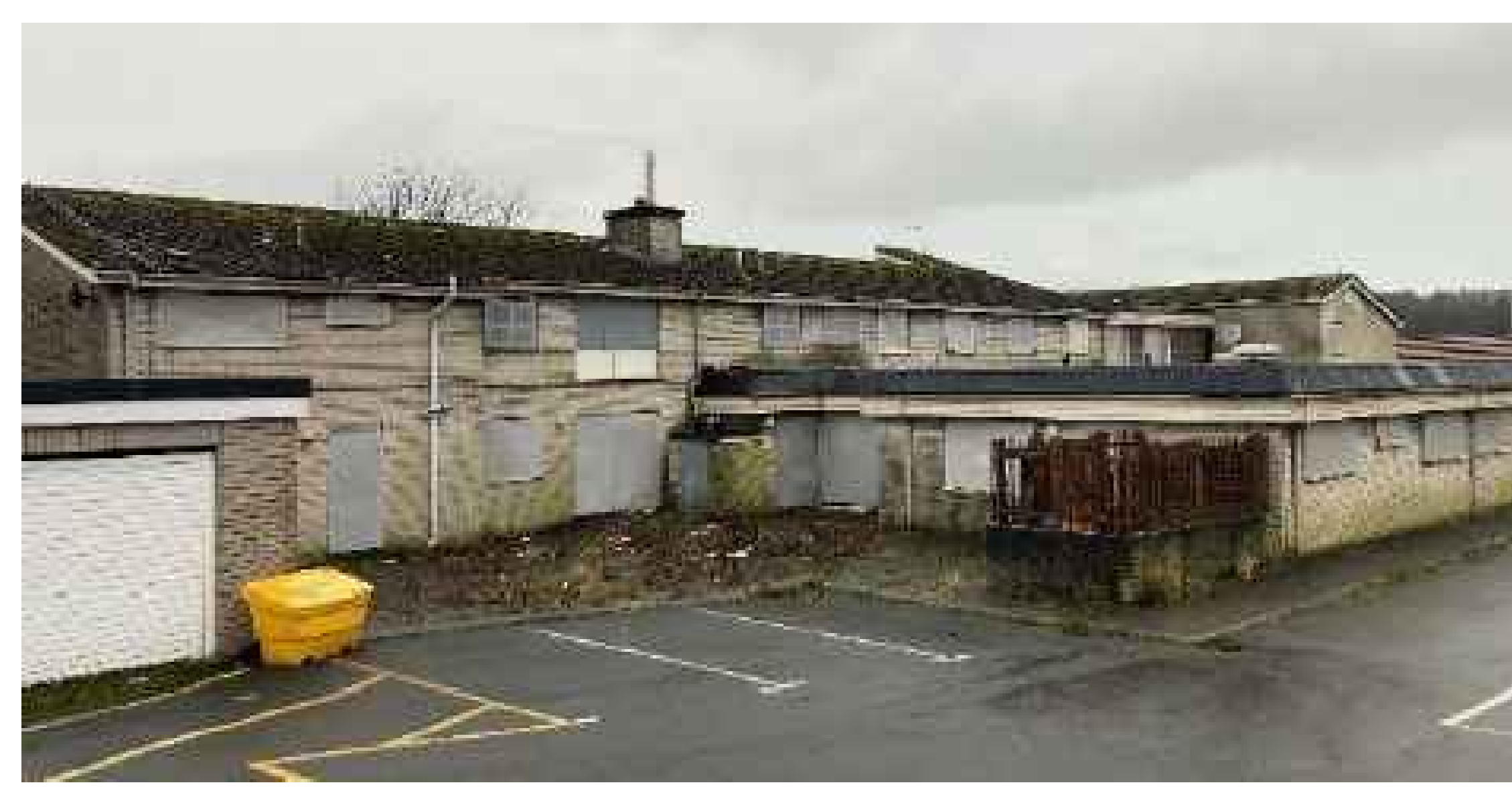
1 VIEW SHOWING NORTH ELEVATION - AS VIEWED FROM NORTH EAST