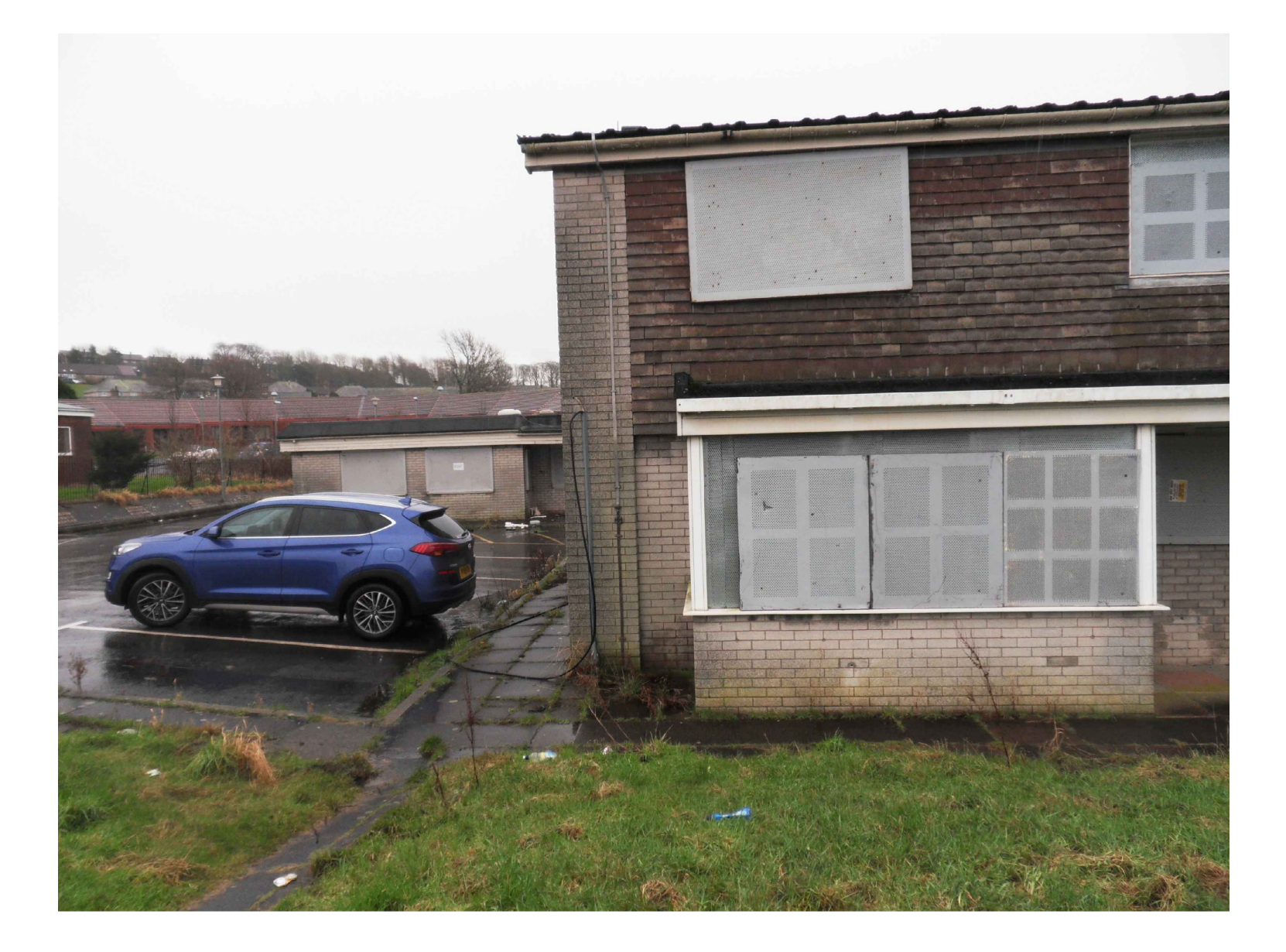
3 VIEW SHOWING END OF WEST ELEVATIONS - CORNER OF MEADOW ROAD AND CAR PARK ENTRANCE