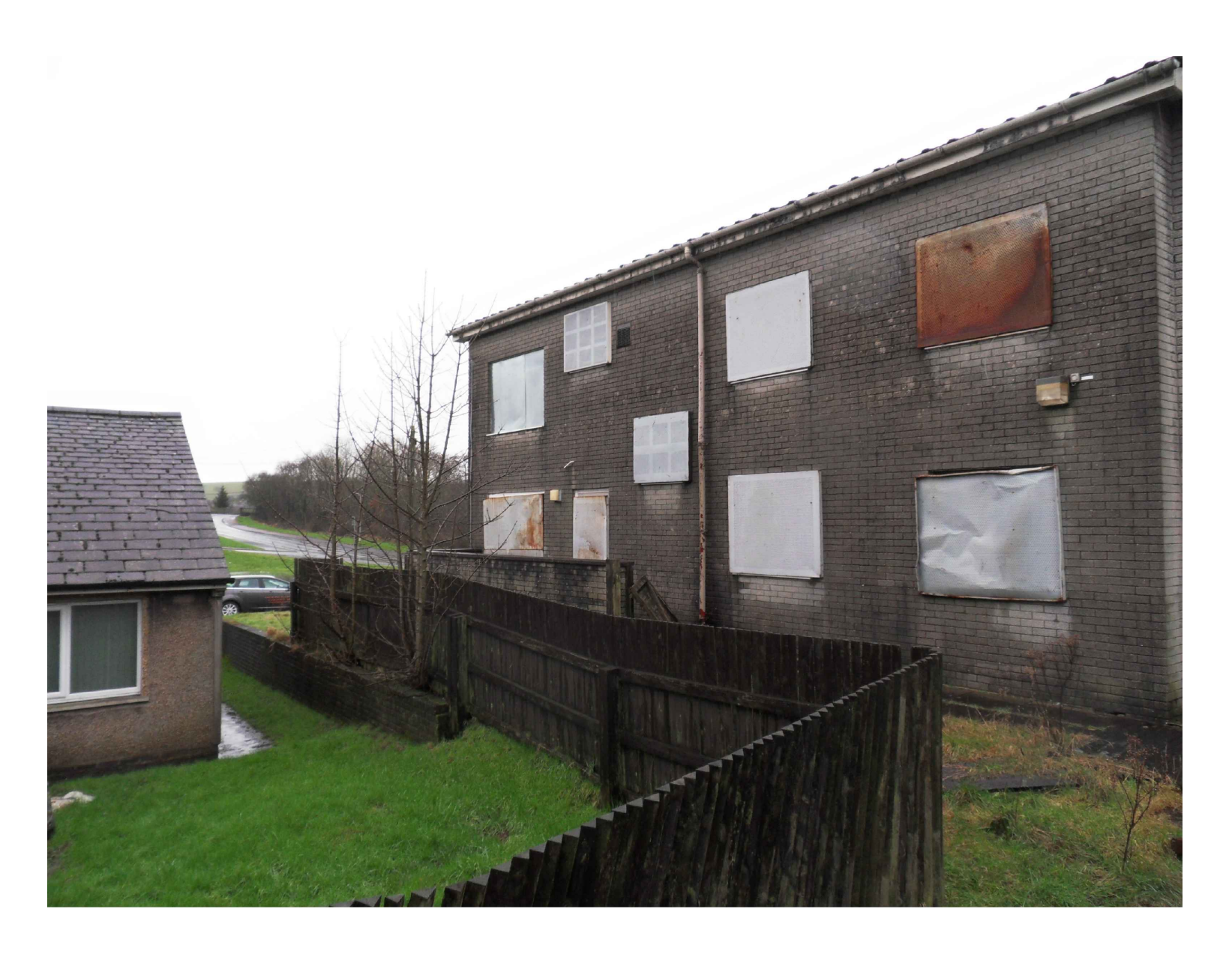
6 PARTIAL VIEW OF EAST ELEVATION (SOUTH, MEADOW ROAD WING) ADJACENT LINK ROAD DWELLINGS