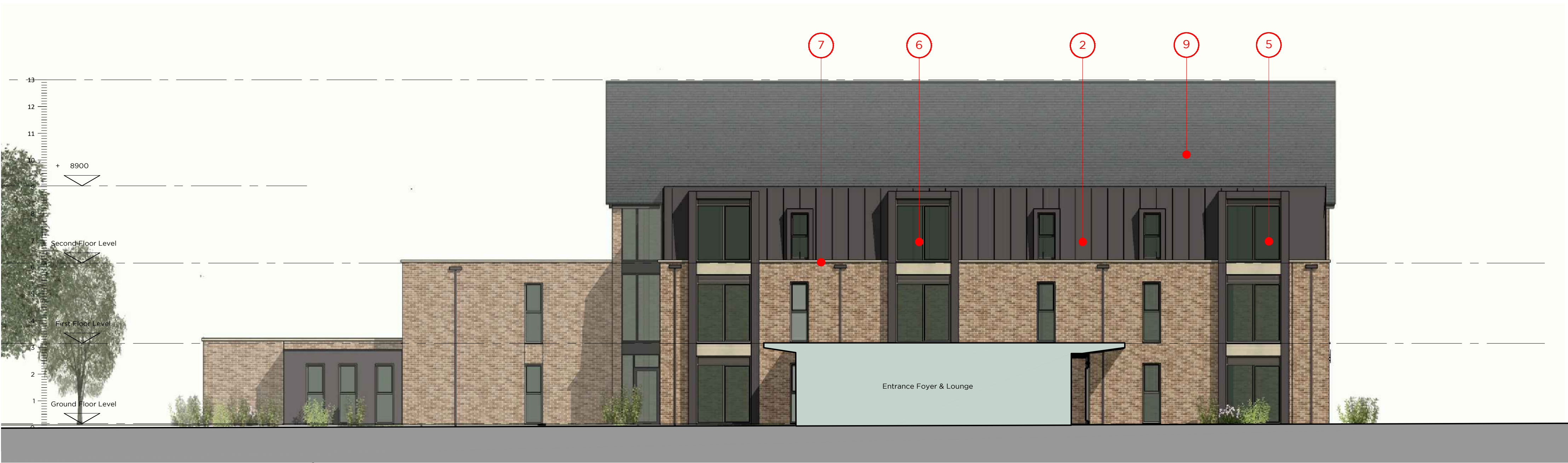
2. EAST (Section through Entrance Foyer & Lounge)