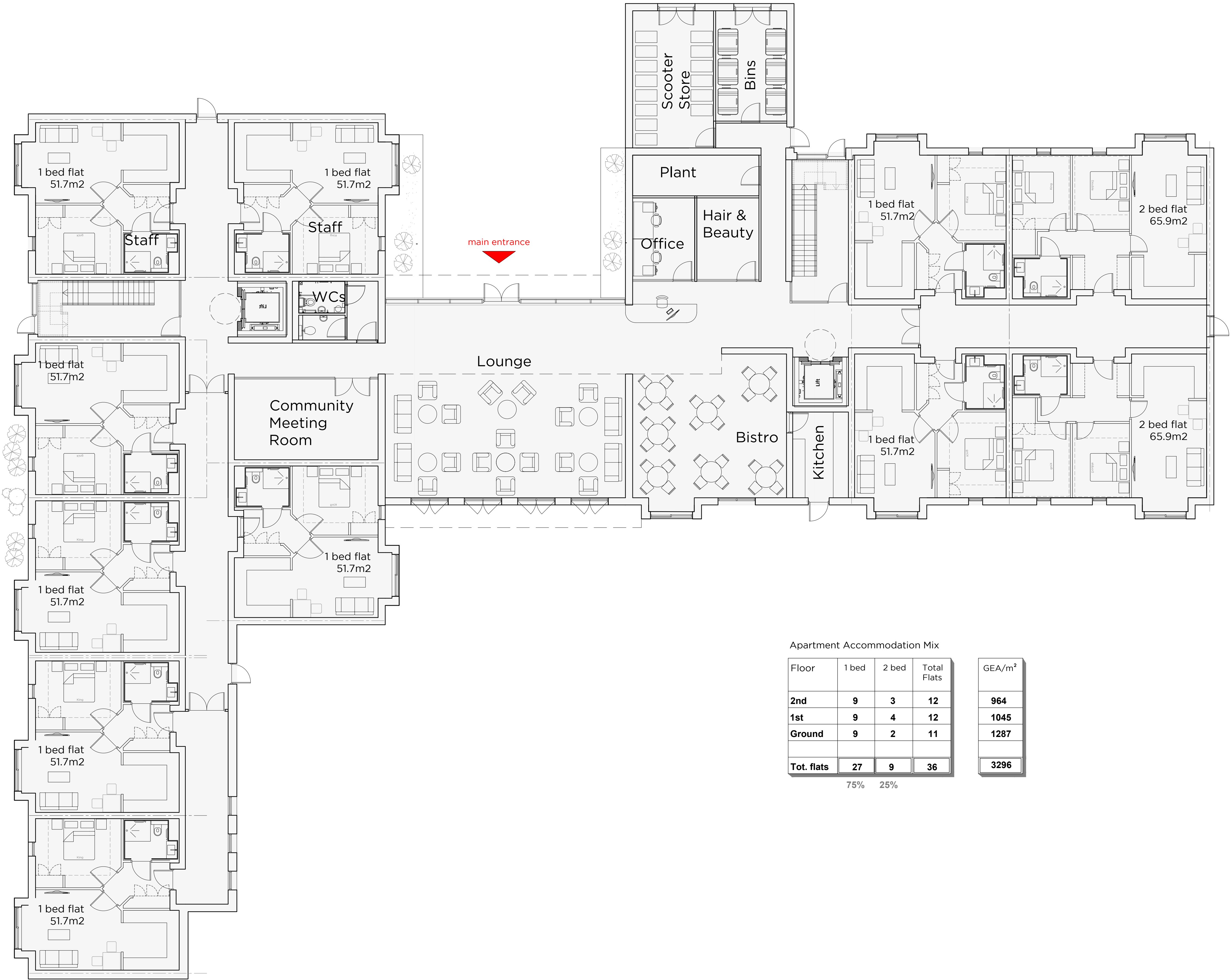
Apartment Accommodation Mix