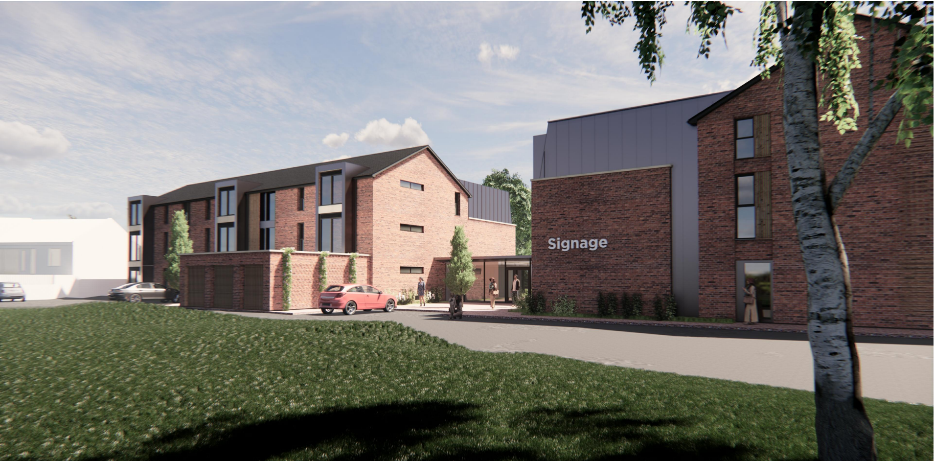
View on approach from site entrance