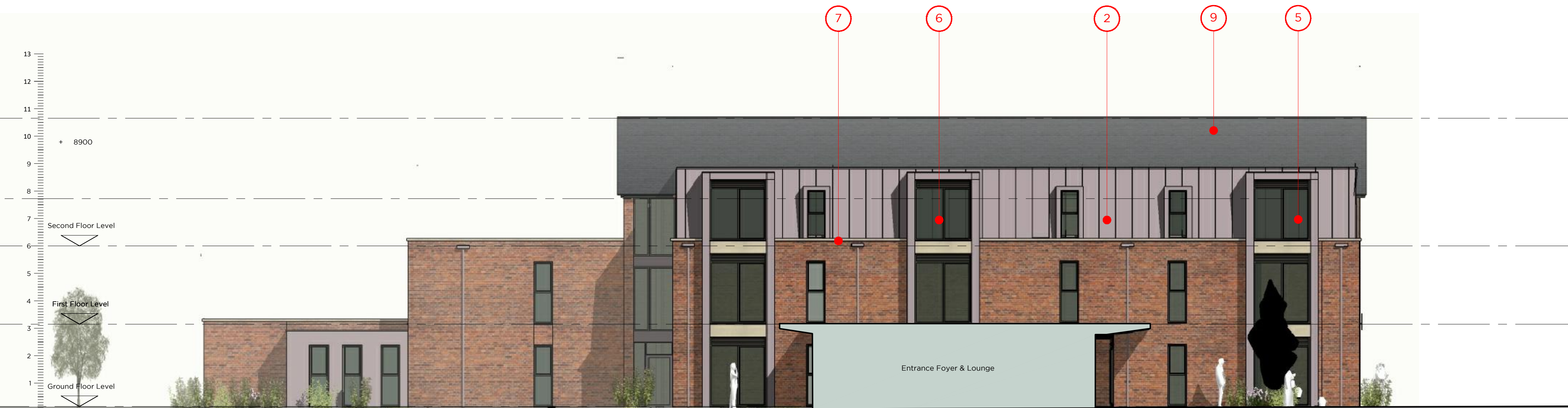
2. EAST (Section through Entrance Foyer & Lounge)