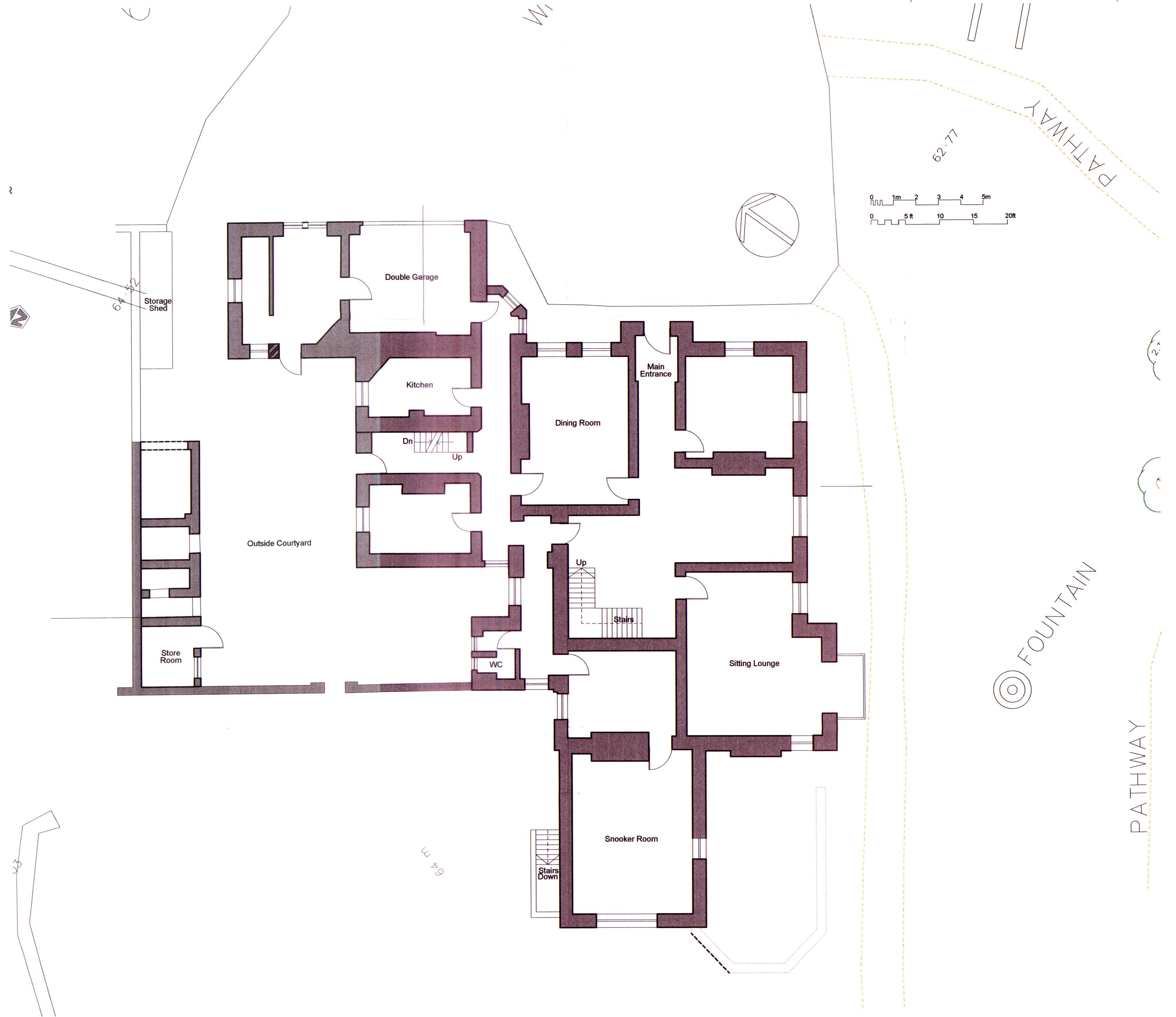
Existing Ground Floor Plan Scale 1:100