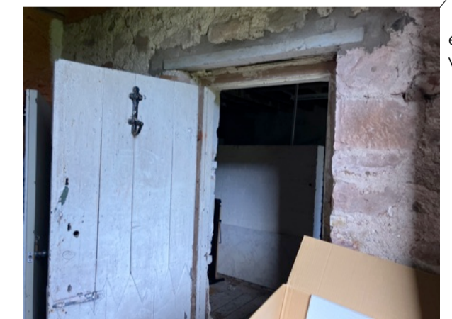
existing wall location wall to be removed.