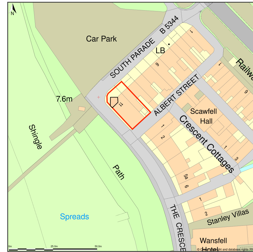
10-11, South Parade, Seascale, Cumbria, CA20 1PZ

Location Plan shows area bounded by: 303649.88, 500862.86, 303791.31, 501004.28 (at a scale of 1:1250), OSGridRef: NY 372 93. The representation of a road, track or path is no evidence of a right of way. The representation of features as lines is no evidence of a property boundary. Produced on 9th Jun 2023 from the Ordnance Survey National Geographic Database and incorporating surveyed revision available at this date. Reproduction in whole or part is prohibited without the prior permission of Ordnance Survey. © Crown copyright 2023. Supplied by www.buyaplan.co.uk a licensed Ordnance Survey partner (100053143). Unique plan reference: #00826310-850F18. Ordnance Survey and the OS Symbol are registered trademarks of Ordnance Survey, the national mapping agency of Great Britain. Buy A Plan® logo, pdf design and the www.buyaplan.co.uk website are Copyright © Passinc Ltd 2023.