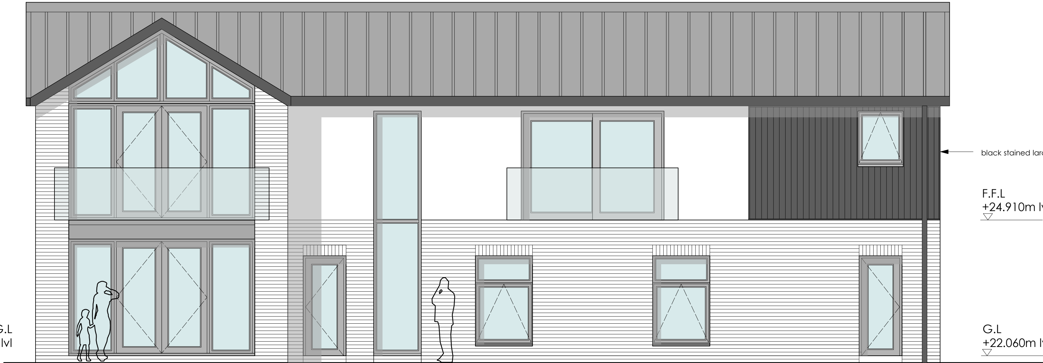
REAR ELEVATION TO BECK