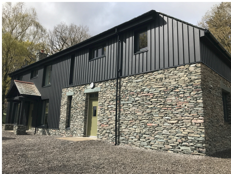
black stained larch installed in Buttermere

GUTTERS & RAIN WATER PIPES - Anthracite uPVC