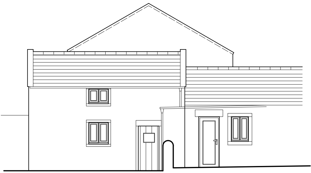
WEST ELEVATION (SEAWARD)