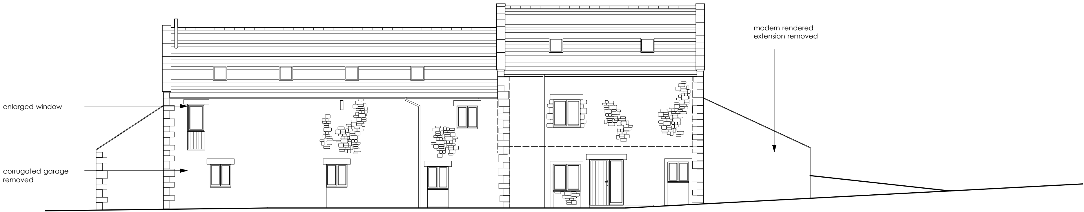
WEST ELEVATION ( COURTYARD)