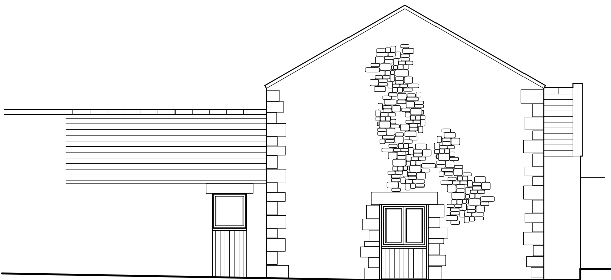
EAST ELEVATION (ACCESS LANE)