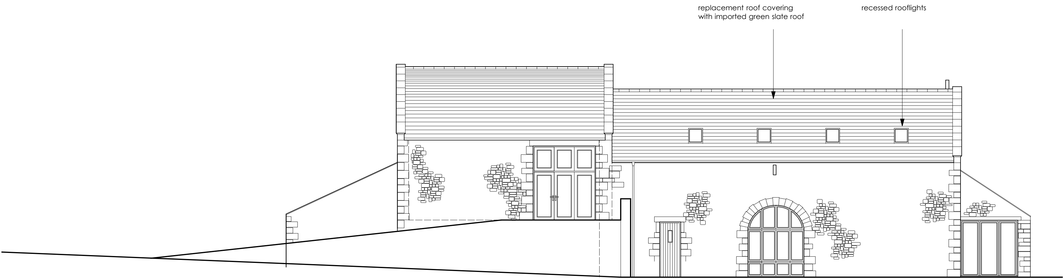
EAST ELEVATION ( ROADSIDE )