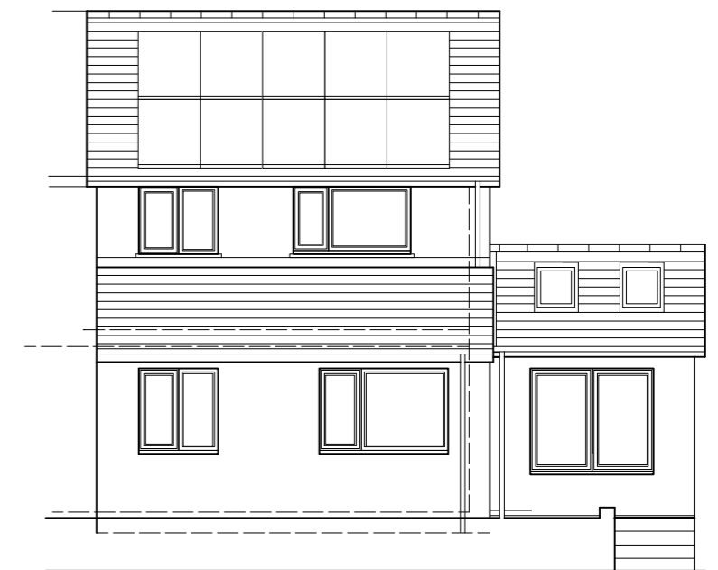
WEST ( REAR ) ELEVATION

Rev : C 13/12/20 - gable fenestration altered Rev : B 10/12/20 - gable fenestration altered Rev : A 9/12/20 - amended to suit client comments