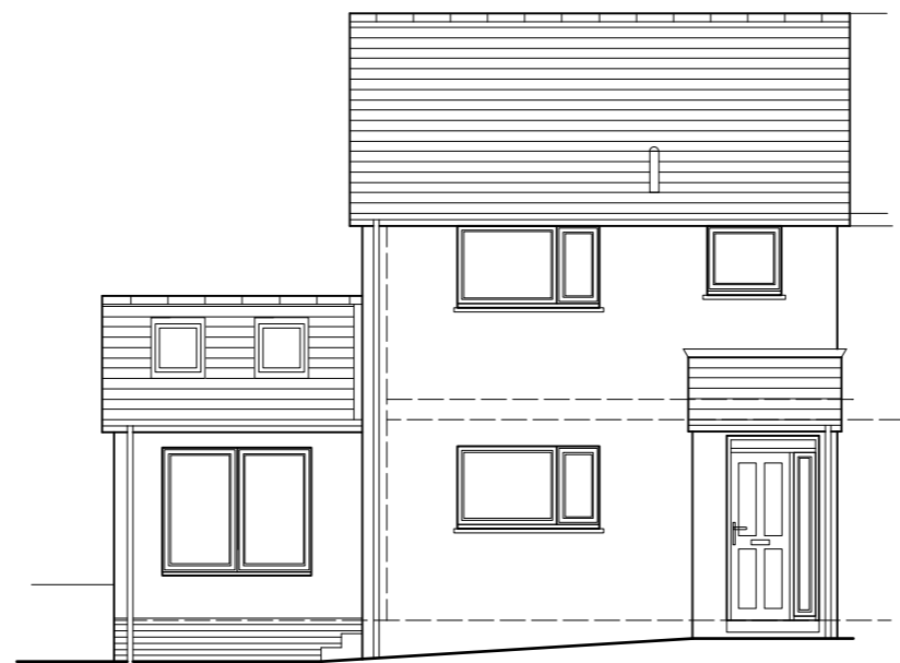
EAST ( FRONT ) ELEVATION

concrete brickwork to dpc K Rend - grey above & tiled roof