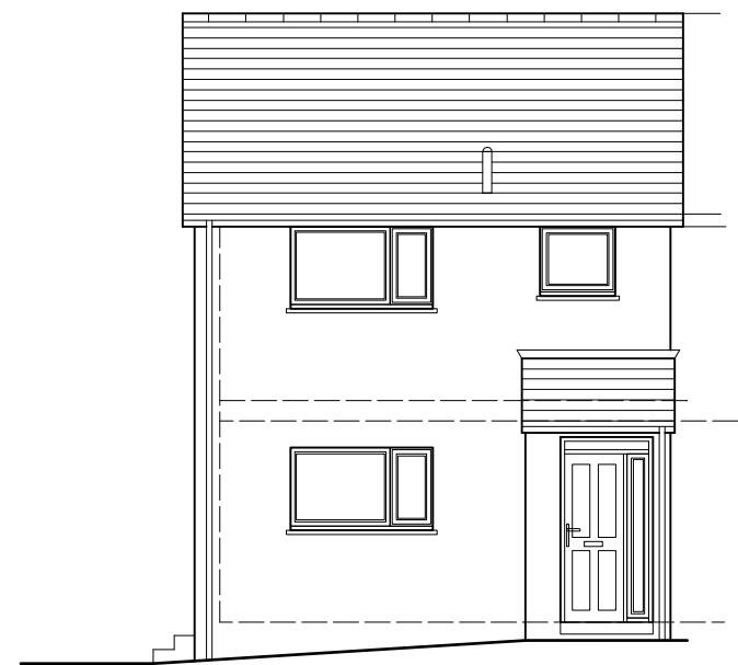
EAST ( FRONT ) ELEVATION