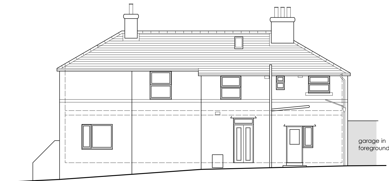
AS EXISTING REAR ELEVATION