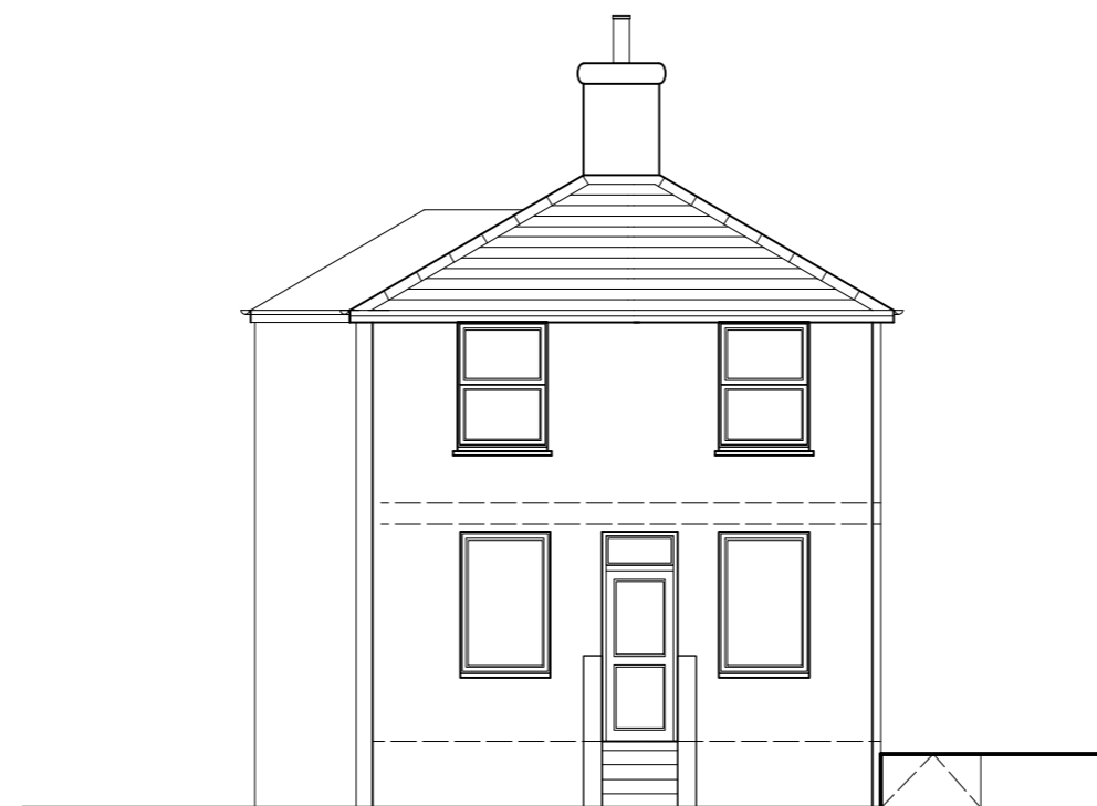
AS EXISTING SIDE ELEVATION ( TO GARDEN)