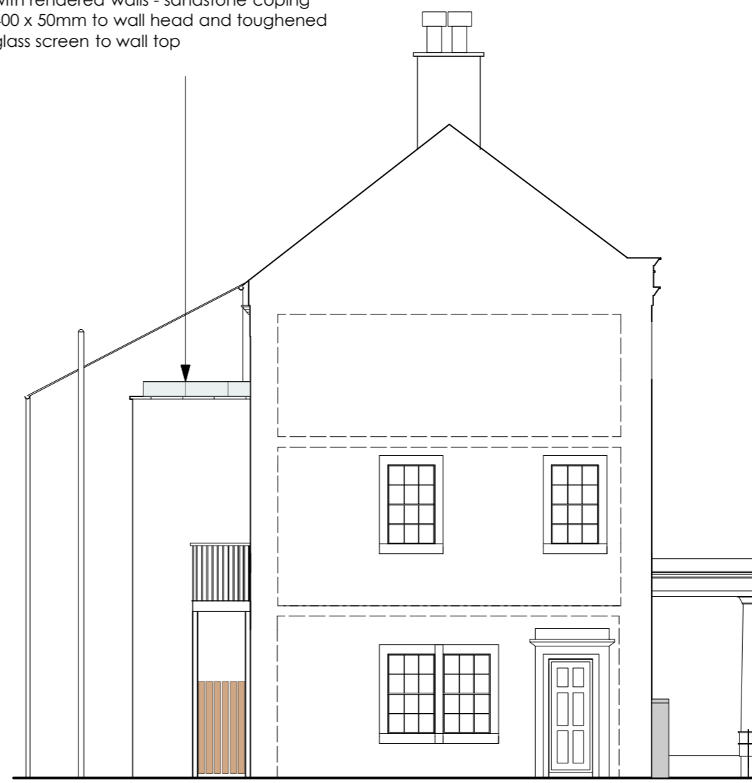
Proposed Gable Elevation - ( Fire Escape stair omitted for clarity )

existing flat roof removed and walls extended up in new blockwork with rendered walls - sandstone coping 400 x 50mm to wall head and toughened glass screen to wall top