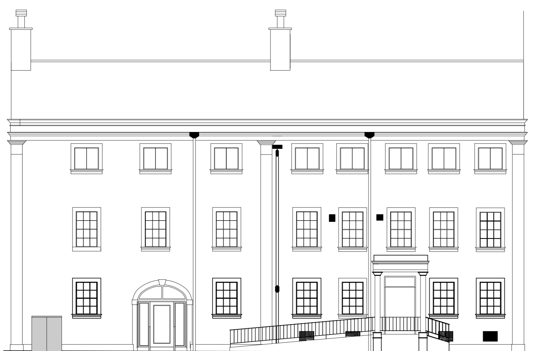
Front Elevation to Harbour

meter room cedar timber screening to form storage 19 x 100mm wide boarding onto galvanised steel framework