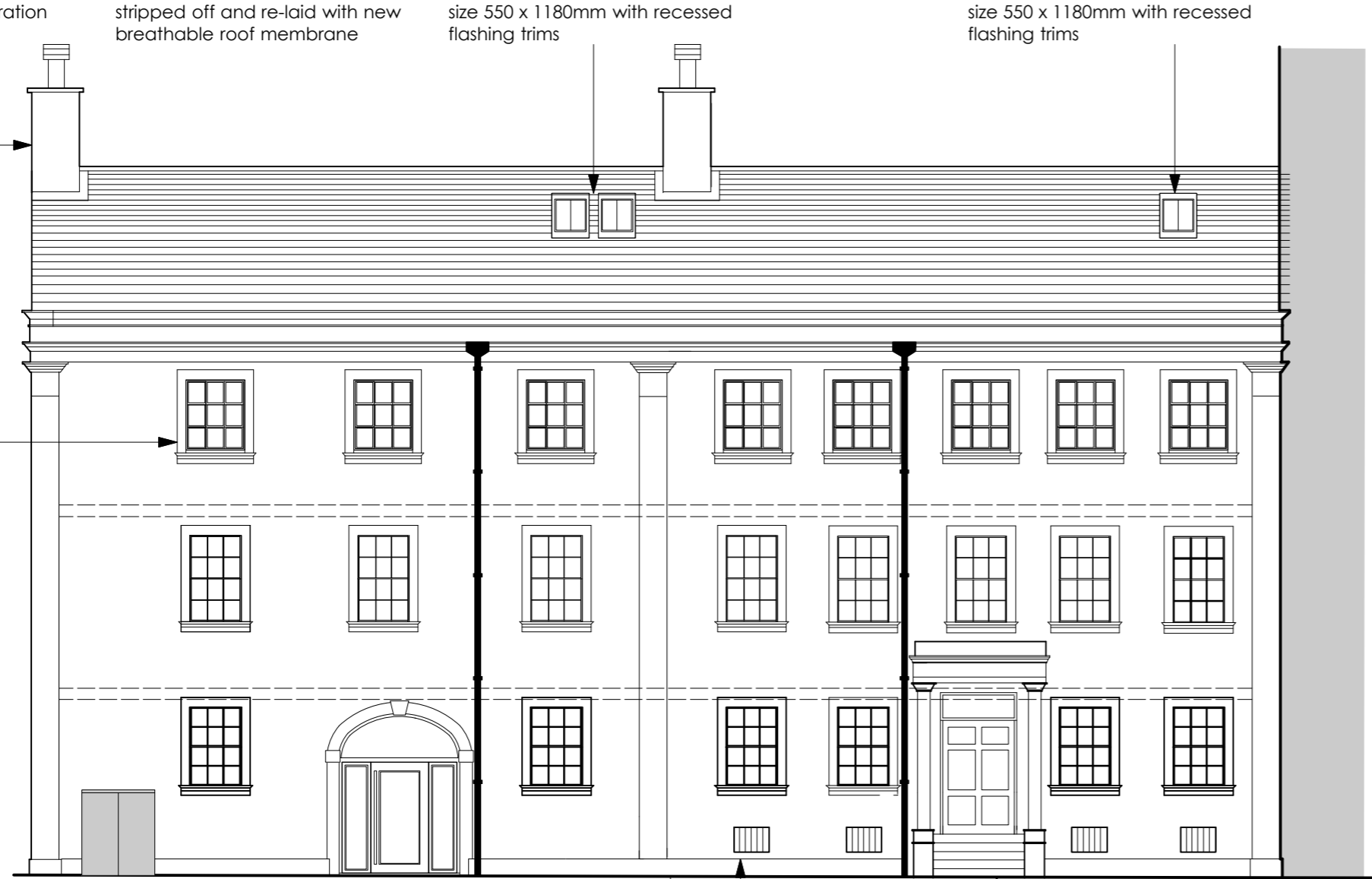
Front Elevation to Harbour new timber double glazed door screen - existing railing to side of ramp removed

second floor windows lowered to provide outlook to harbour - render bands with timber sw sliding sash casements