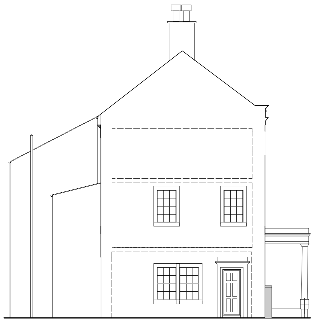
Existing Gable Elevation - ( Fire Escape stair omitted for clarity )

existing flat roof removed and walls extended up in new blockwork with rendered walls - sandstone coping 400 x 50mm to wall head and toughened glass screen to wall top