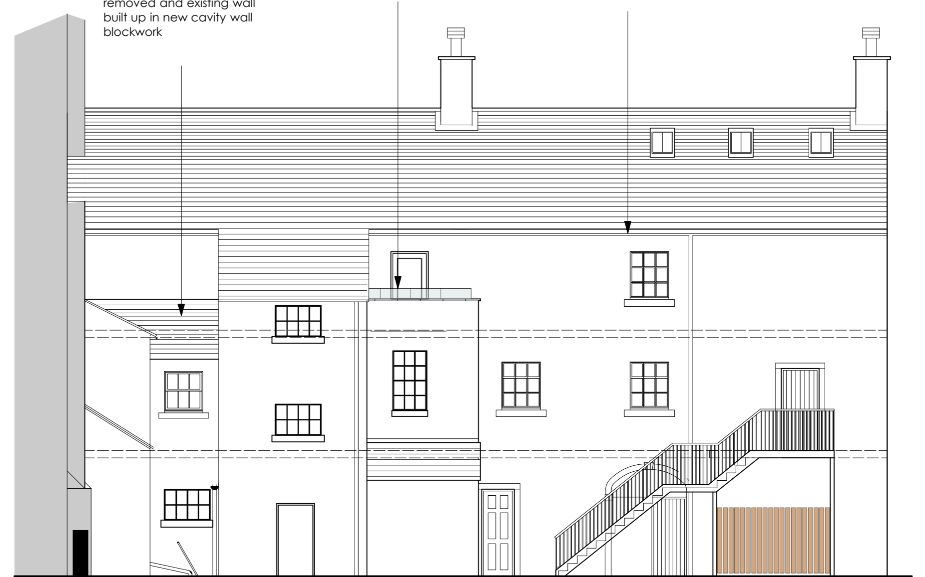
Rear Elevation to car park

existing mono pitch slate roof removed and existing wall built up in new cavity wall blockwork