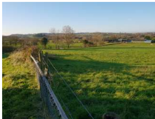
11 – from eastern corner – facing SW across site boundary