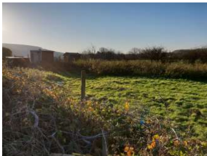
14 – from SE corner – facing west across site