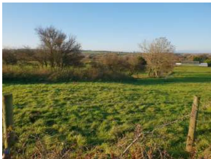
14 – from SE corner – facing west across site