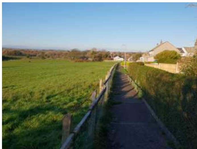
10 – from eastern corner – facing NW across site boundary