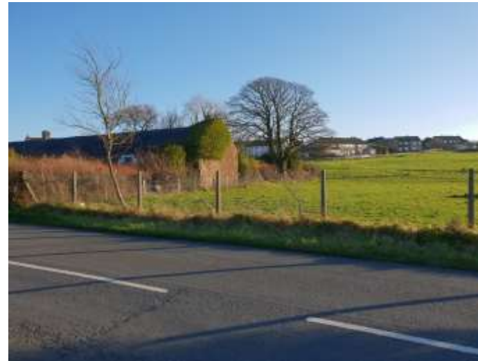
4 - From Jacktrees Rd – facing east towards existing structures to be demolished