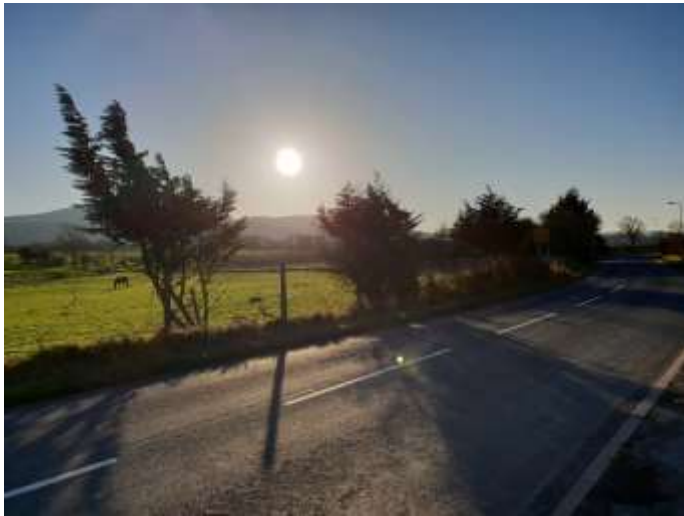
2 – From Jacktrees Rd – facing E towards site