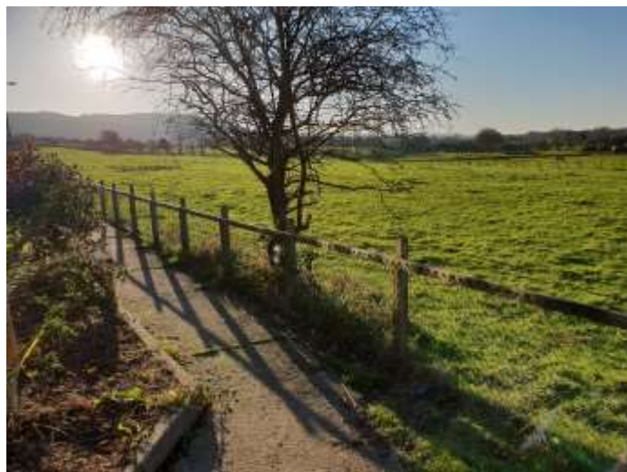
6 – from northern corner – facing SSE across the site