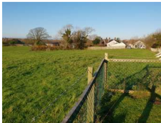
7 – from NE boundary - facing NW