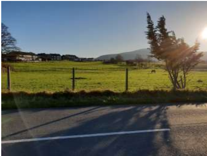
2 – From Jacktrees Rd – facing E towards site