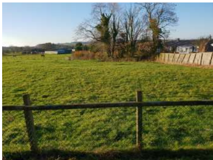
5 – from northern corner – facing SW across the site