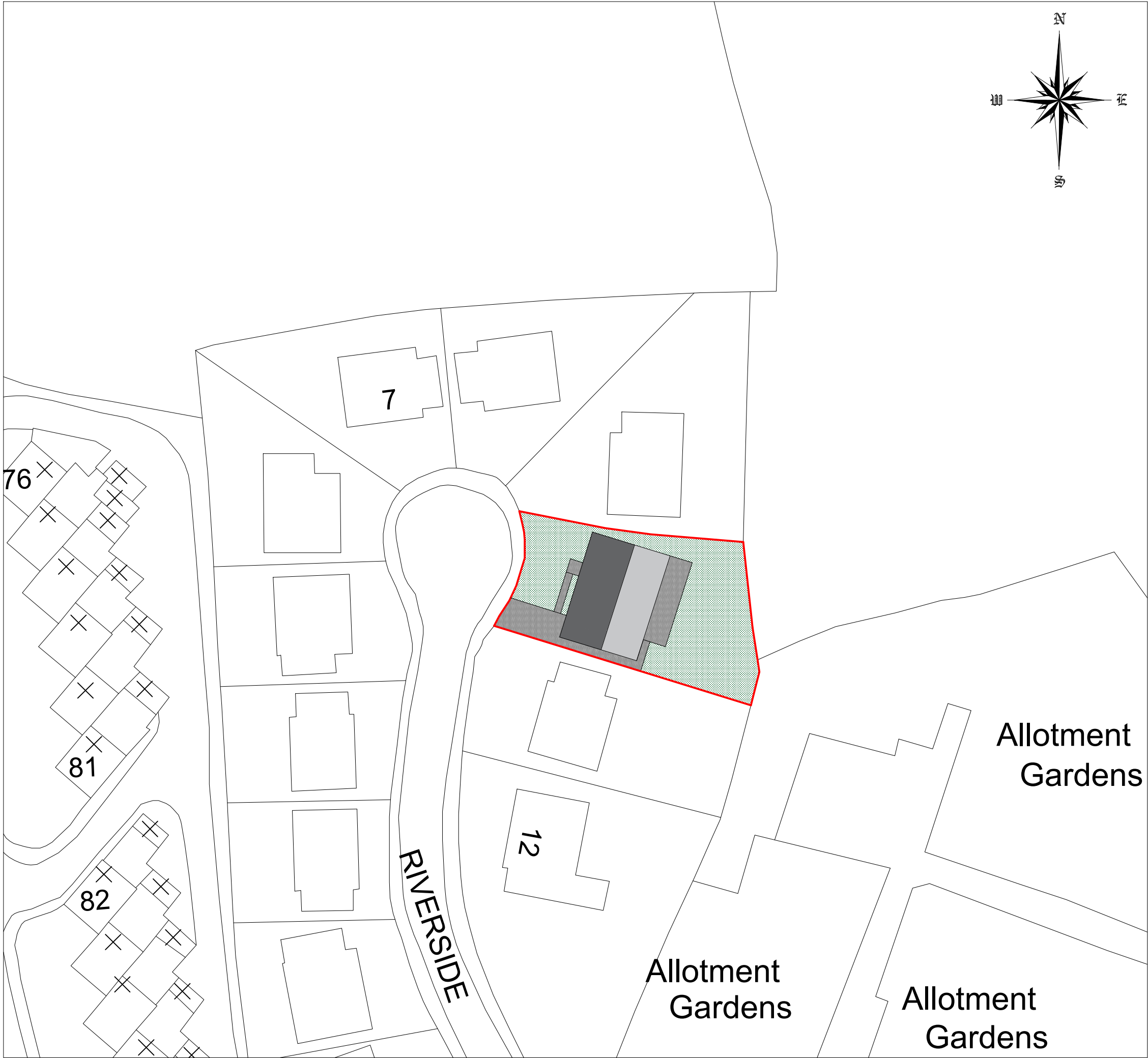
Block Plan 1/500