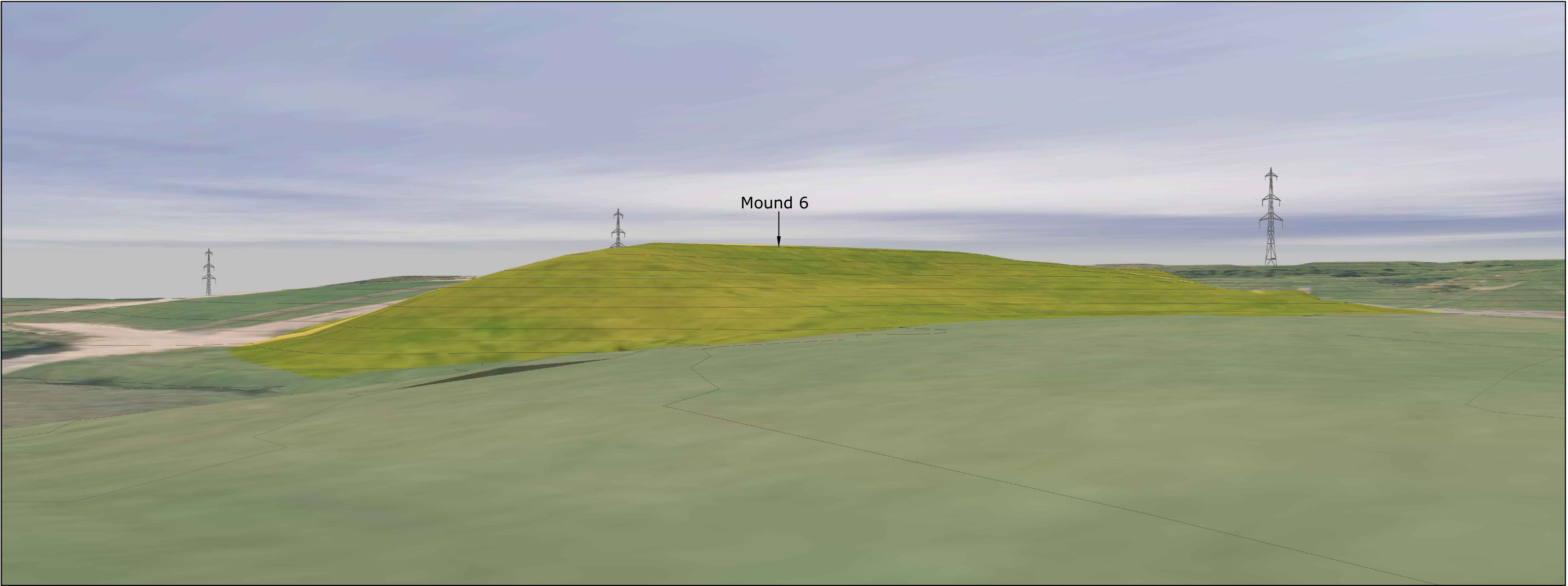
Mound 6 Proposed Cumulative View from 6th Fairway