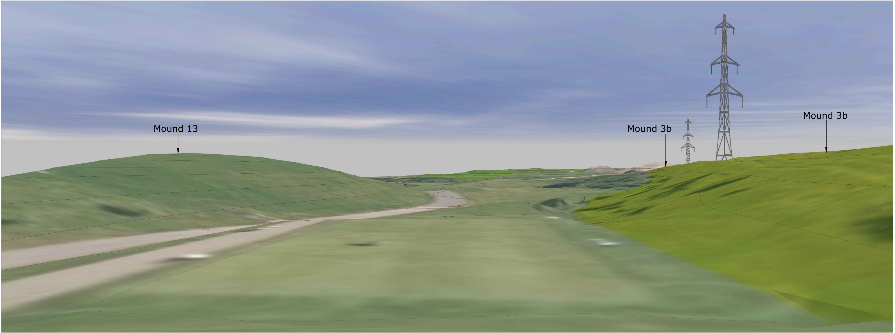
Mound 3 Proposed Cumulative View from 1st Tee