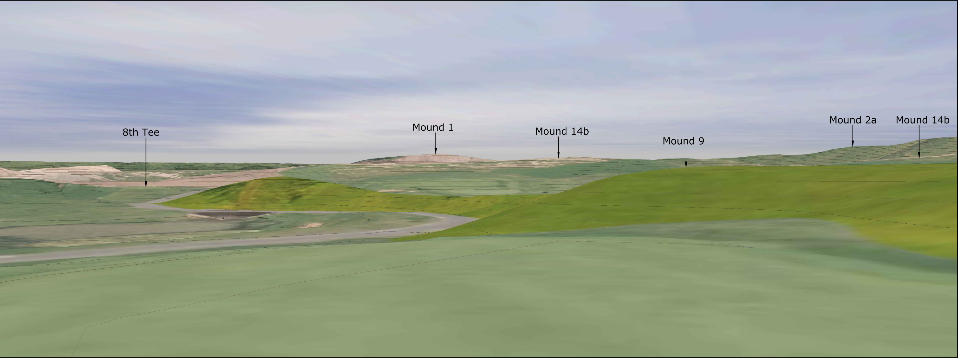
Mound 9 Proposed Cumulative View from 8th Green