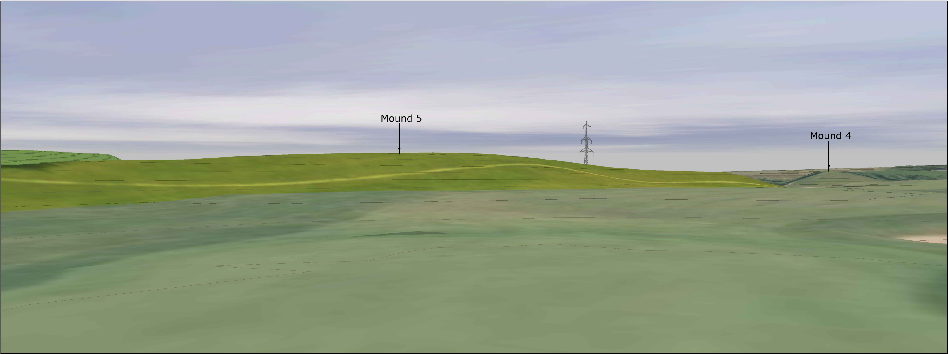
Mound 5 Proposed Cumulative View from 3rd Green