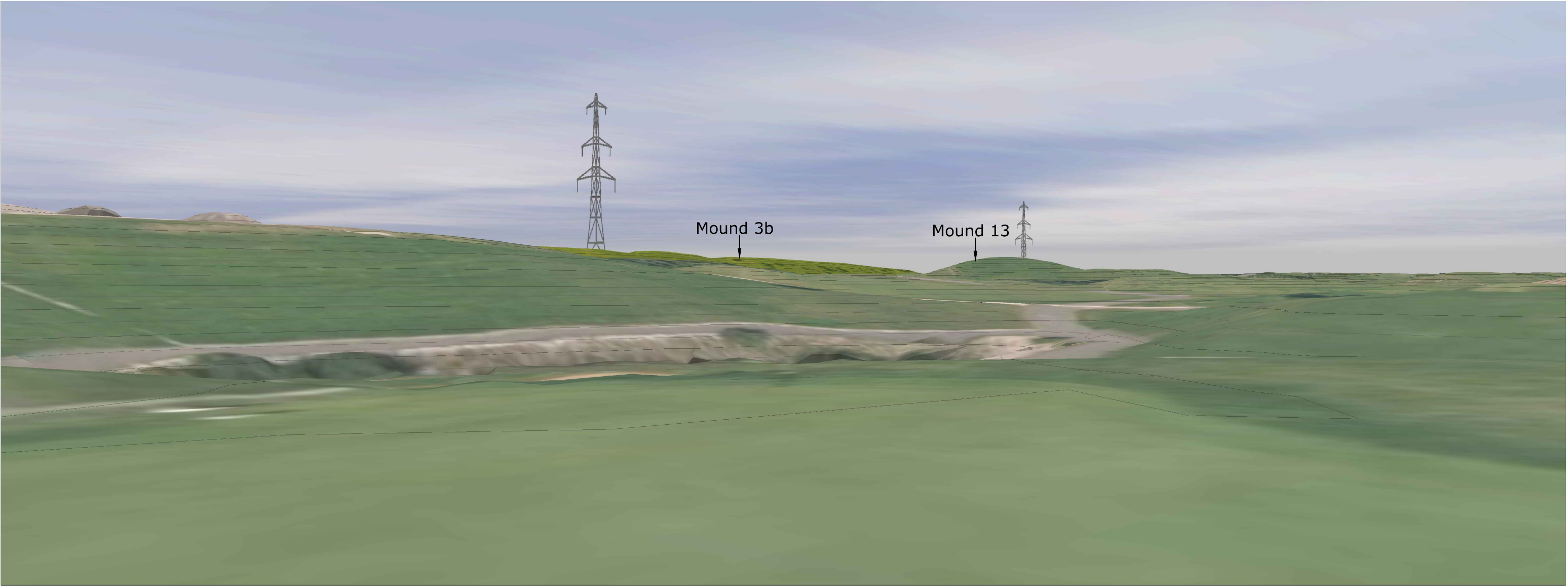
Mound 3 Proposed Cumulative View from 1st Green