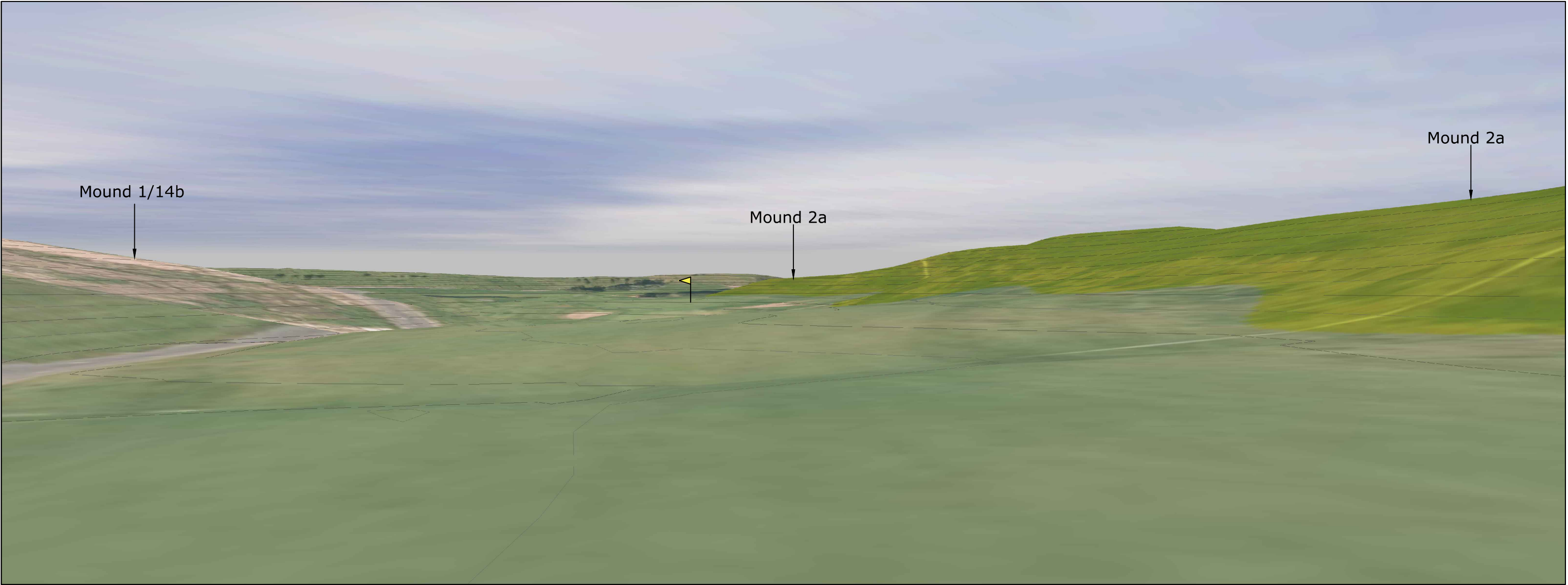
Mound 2 Proposed Cumulative View from 17th Fairway