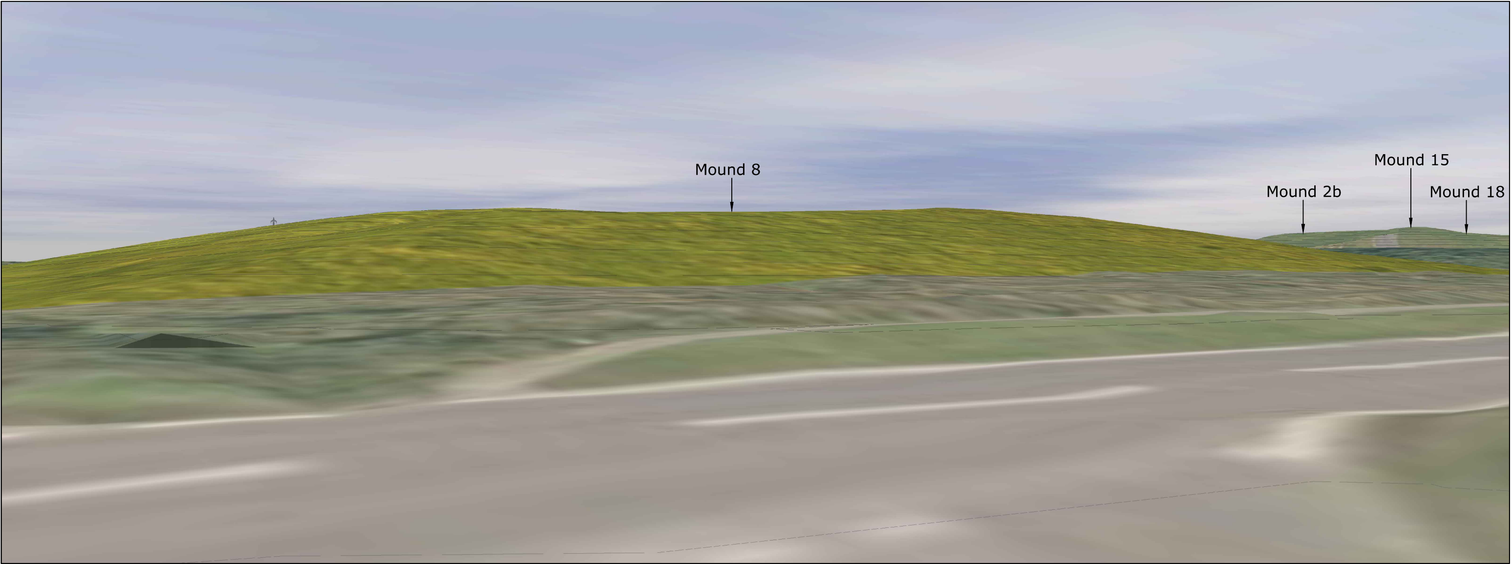
Mound 8 Proposed Cumulative View Junction / PROW