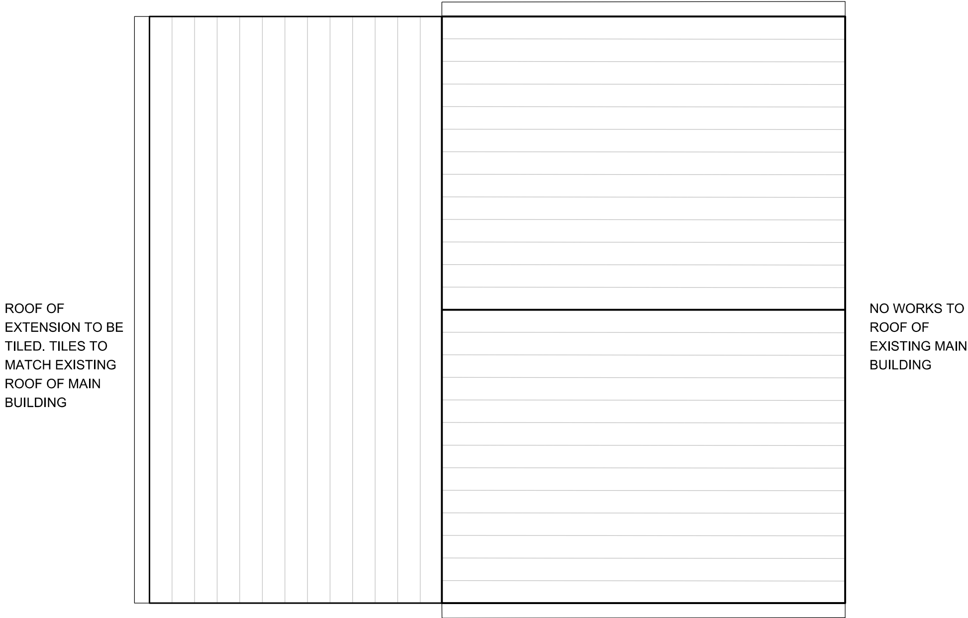
PLAN 3 ROOF PLAN AS PROPOSED