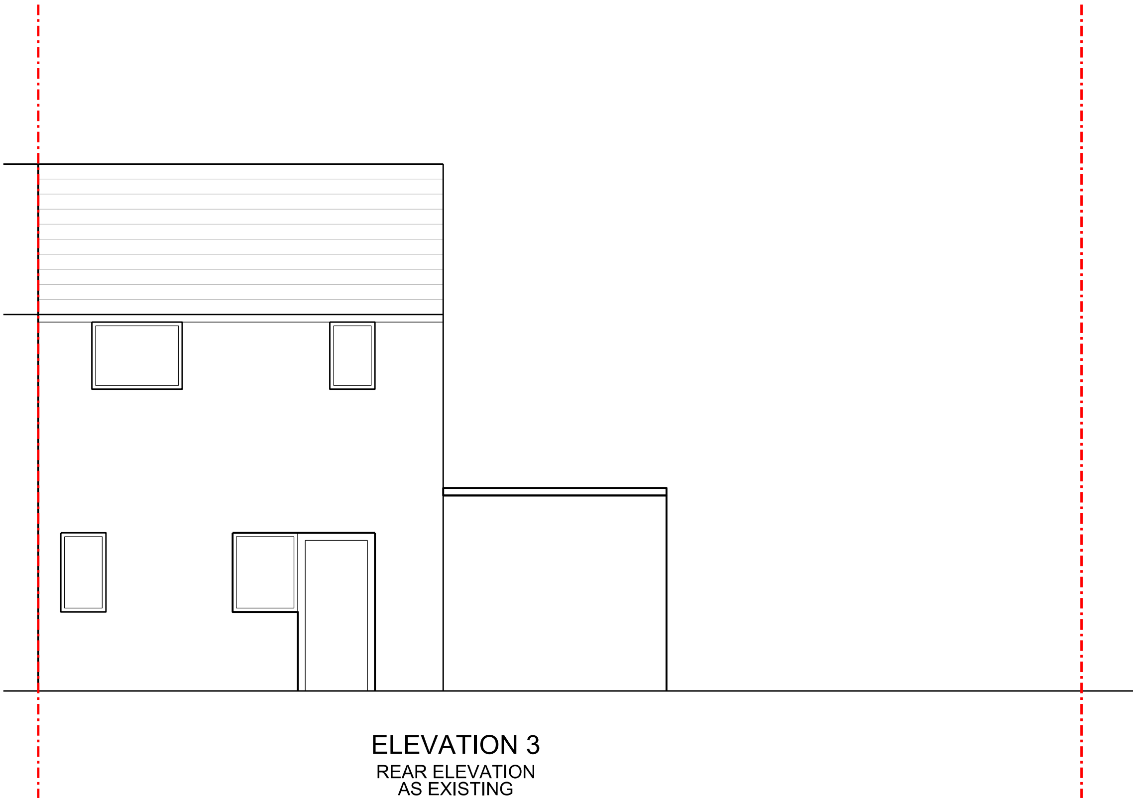
ELEVATION 3 REAR ELEVATION AS EXISTING