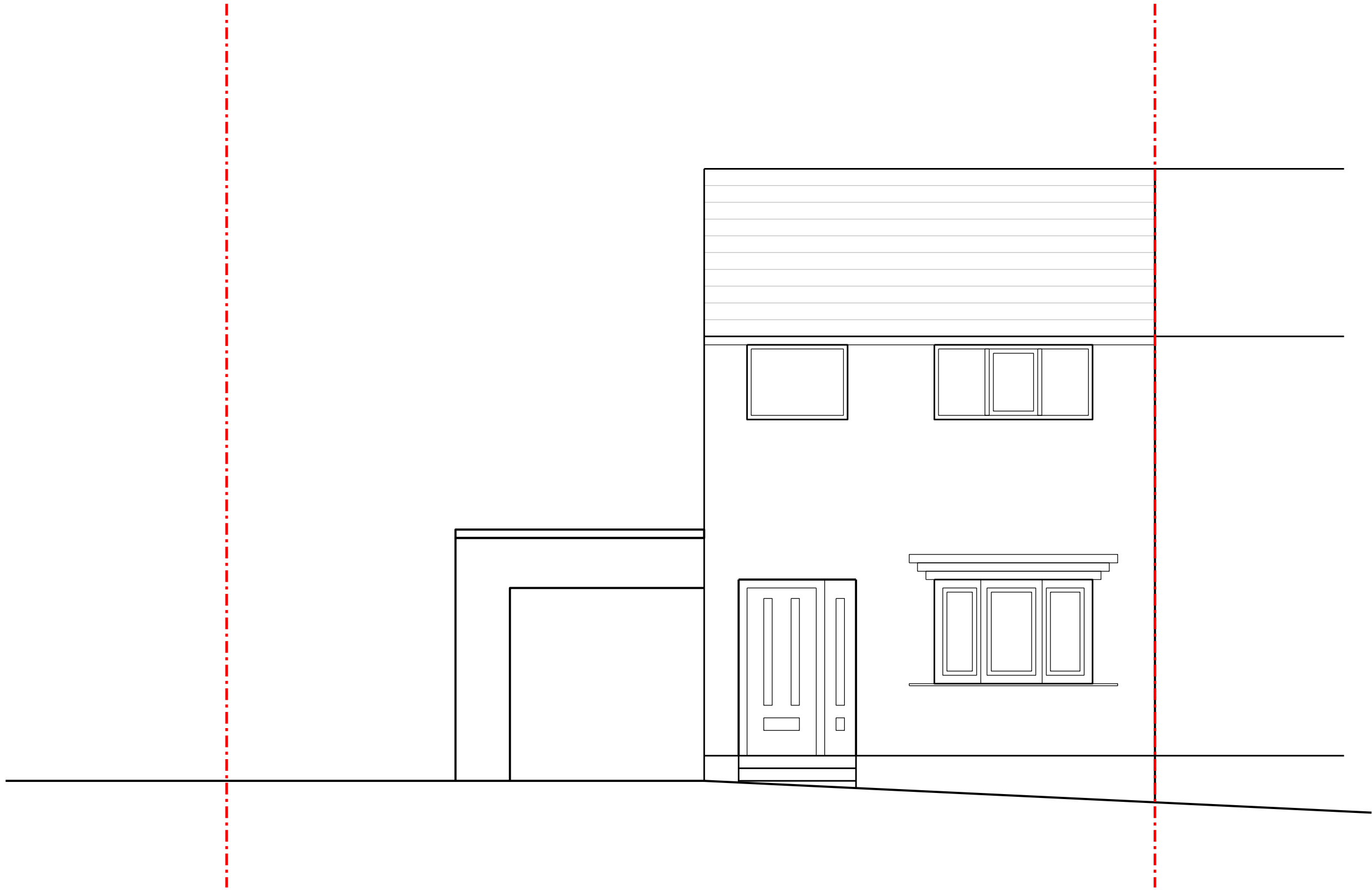
ELEVATION 1 FRONT ELEVATION AS EXISTING