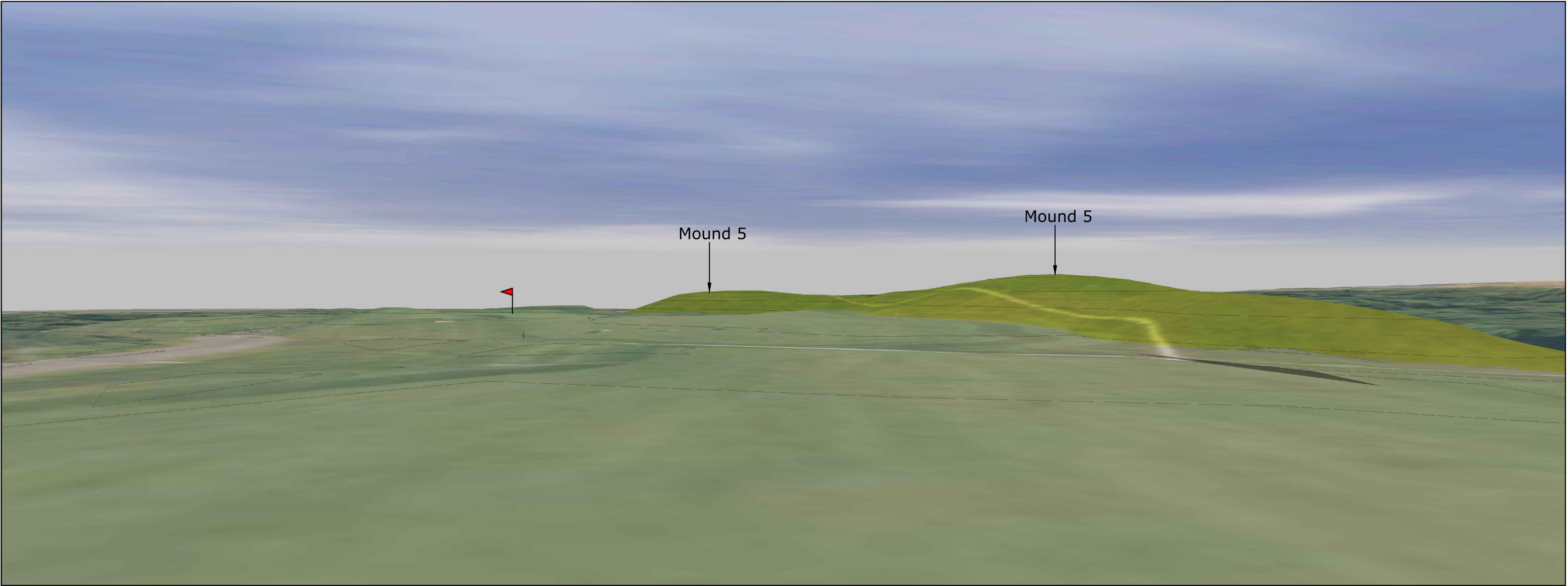
Mound 5 Proposed Cumulative View from 3rd Fairway