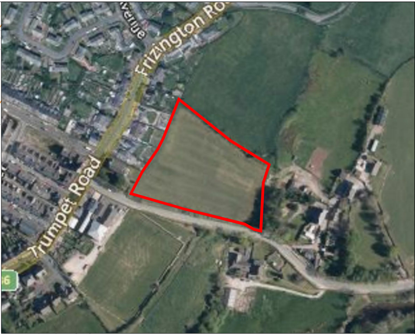
BLOCK PLAN 1:2500