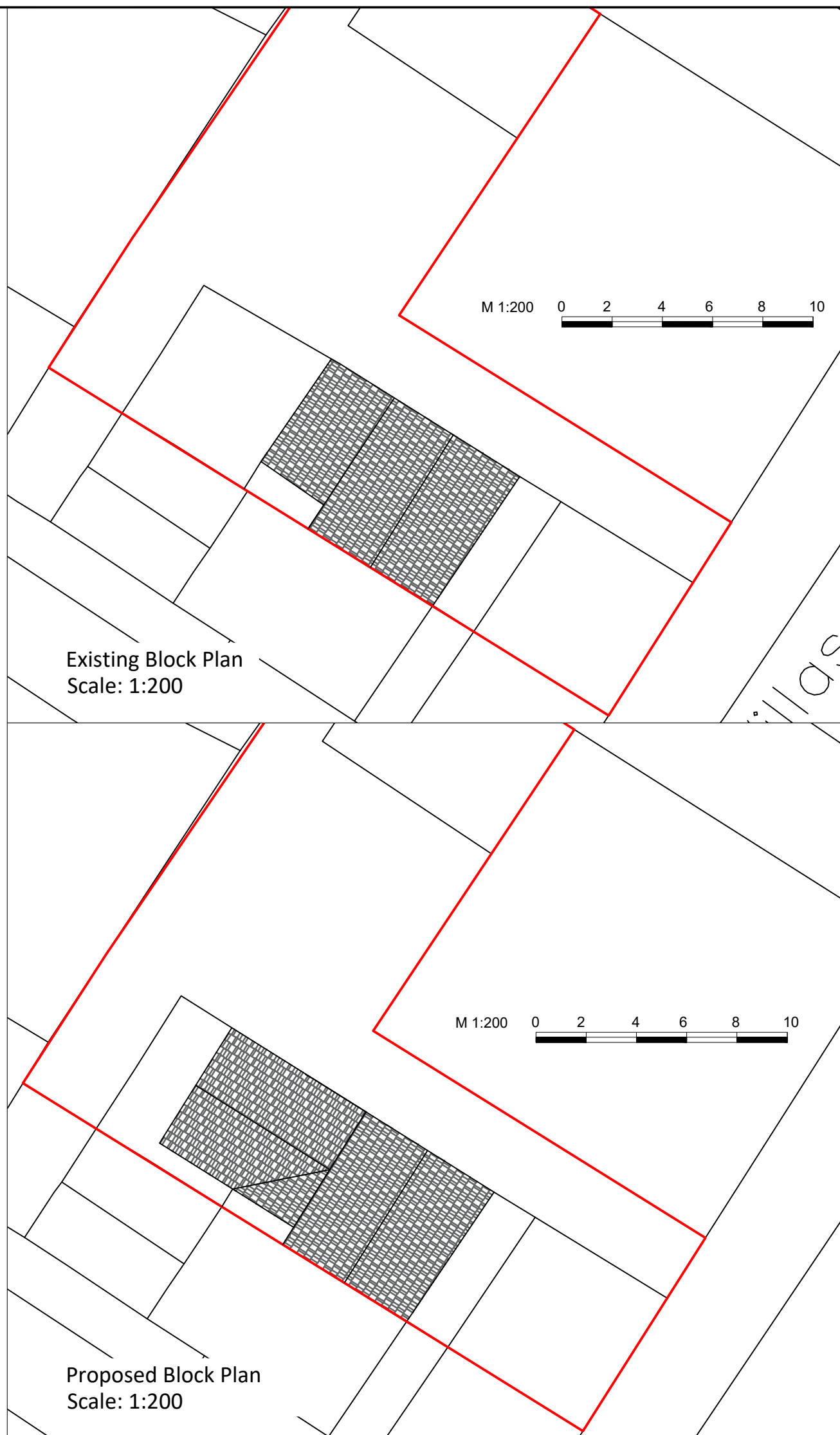
Existing Block Plan Scale: 1:200