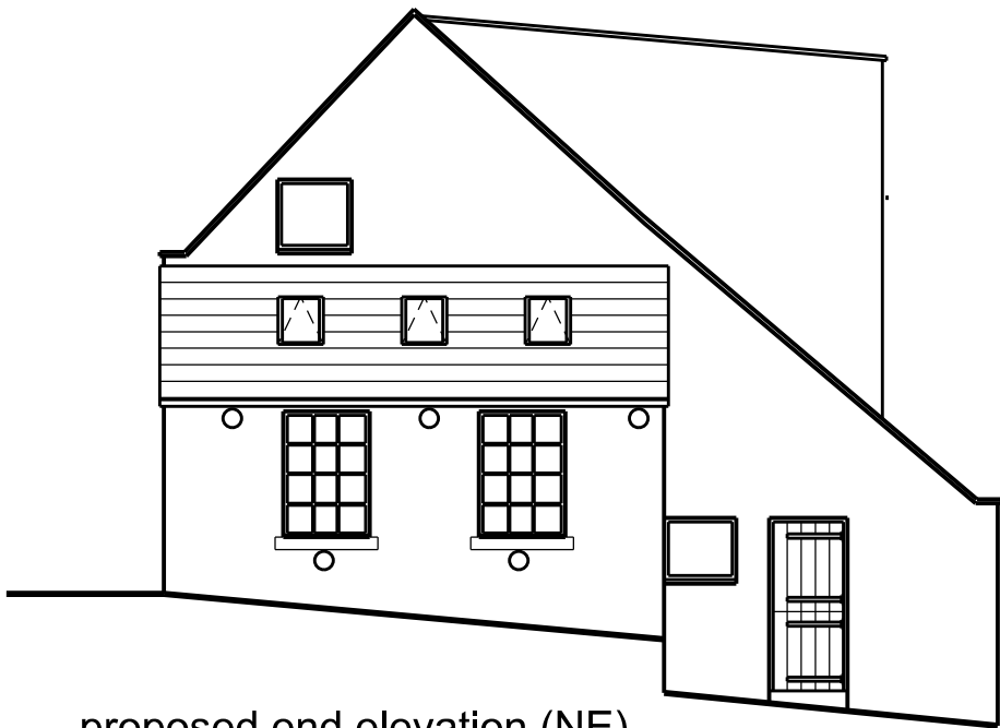
proposed end elevation (NE)