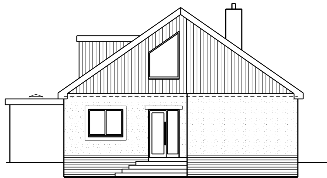
proposed front elevation (south west)