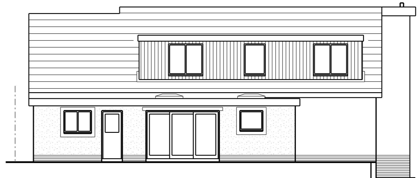
proposed side elevation (north west)