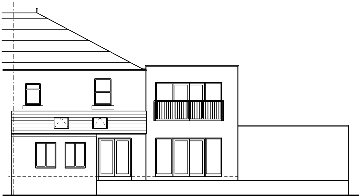
proposed rear elevation (NW)