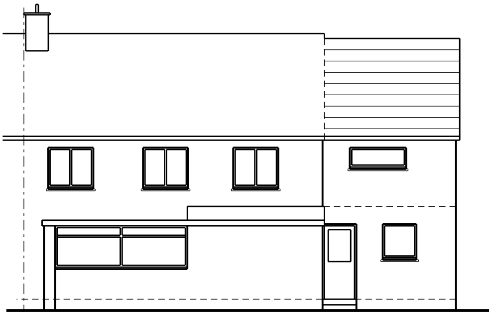
proposed rear elevation (SE)