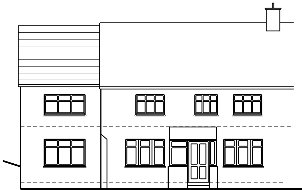
proposed front elevation (NW)