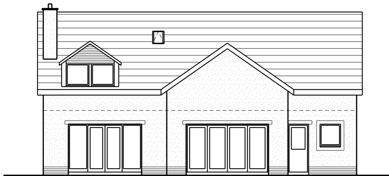
proposed rear elevation (south east)