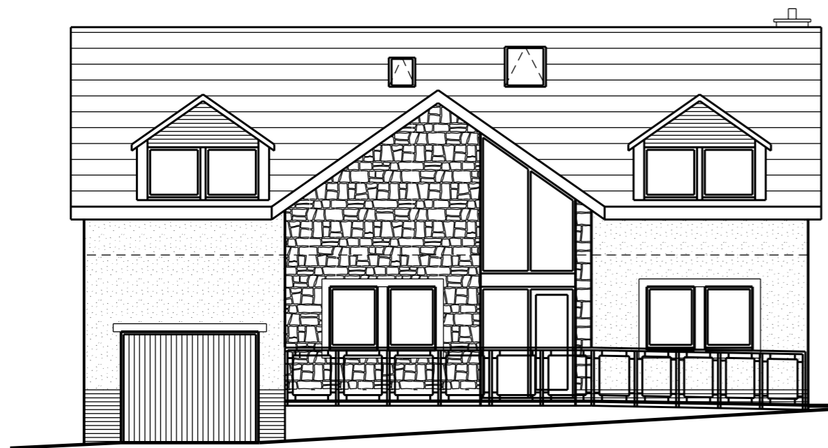
proposed front elevation (north west)