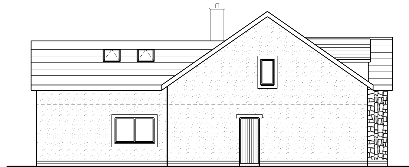
proposed side elevation (north east)