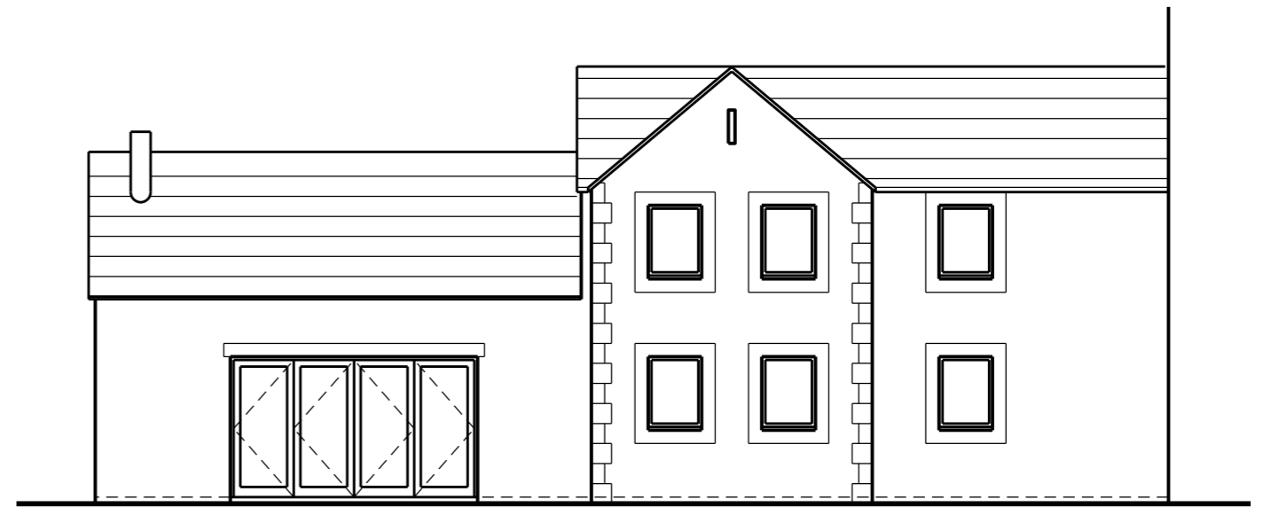
proposed rear elevation (SE)