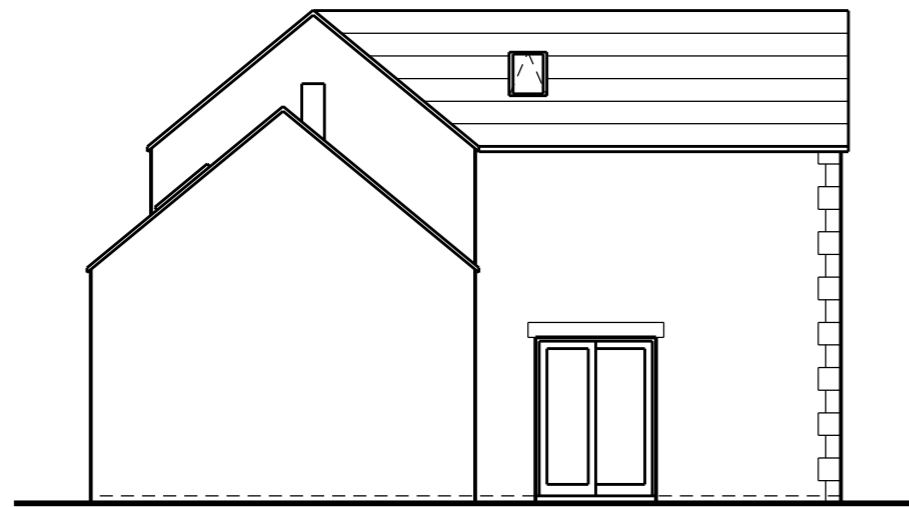
proposed side elevation (SW)