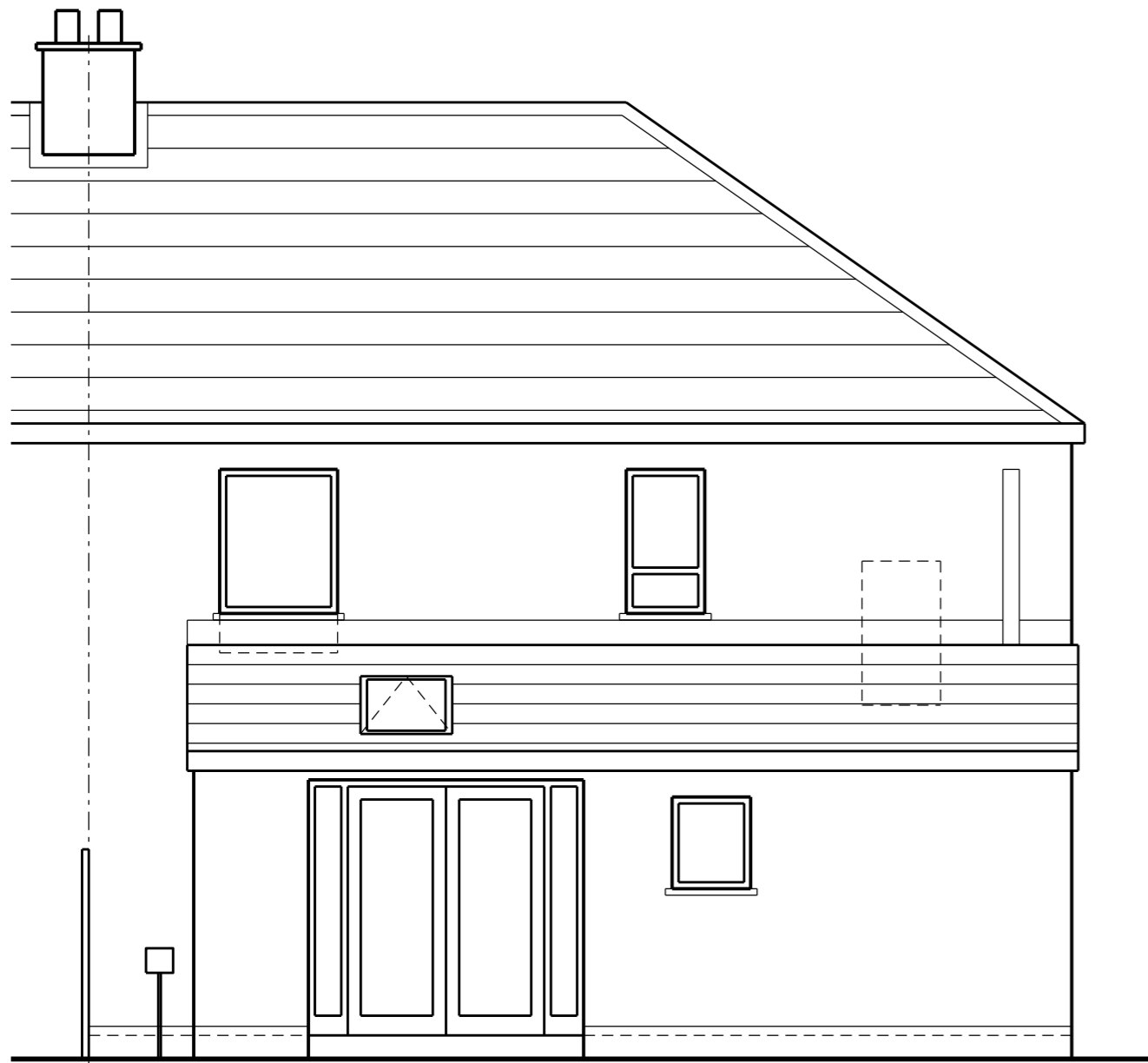
proposed rear elevation