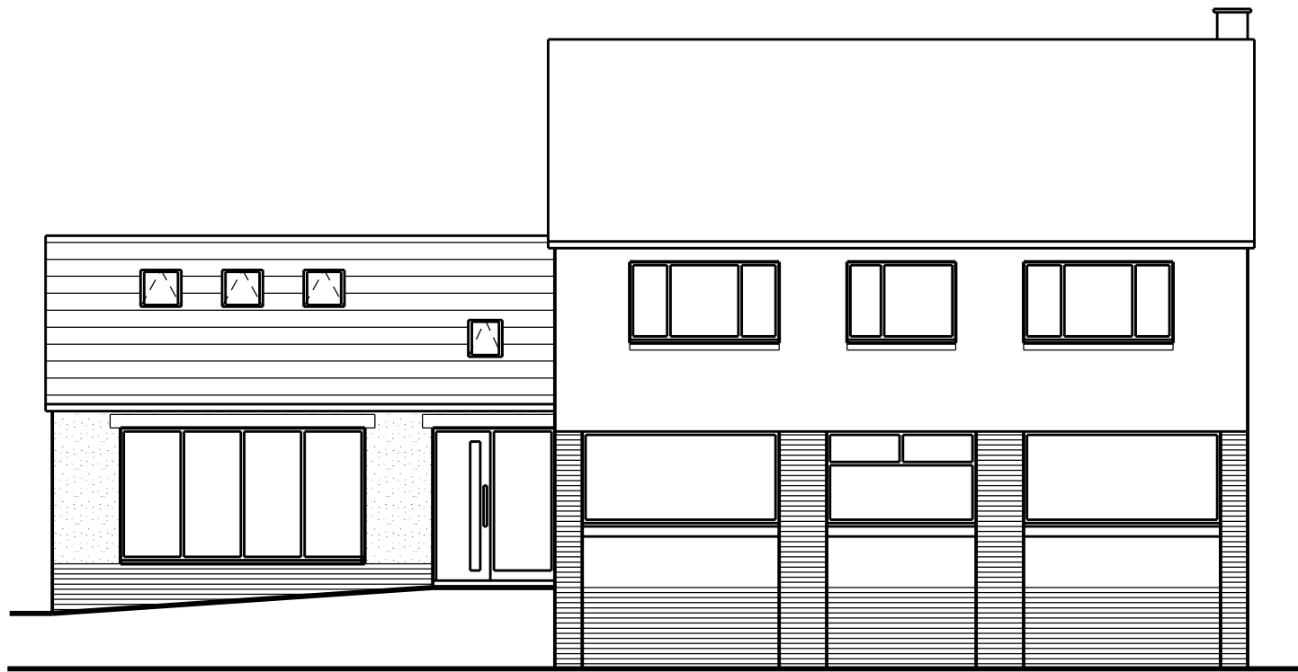
proposed front elevation (east)