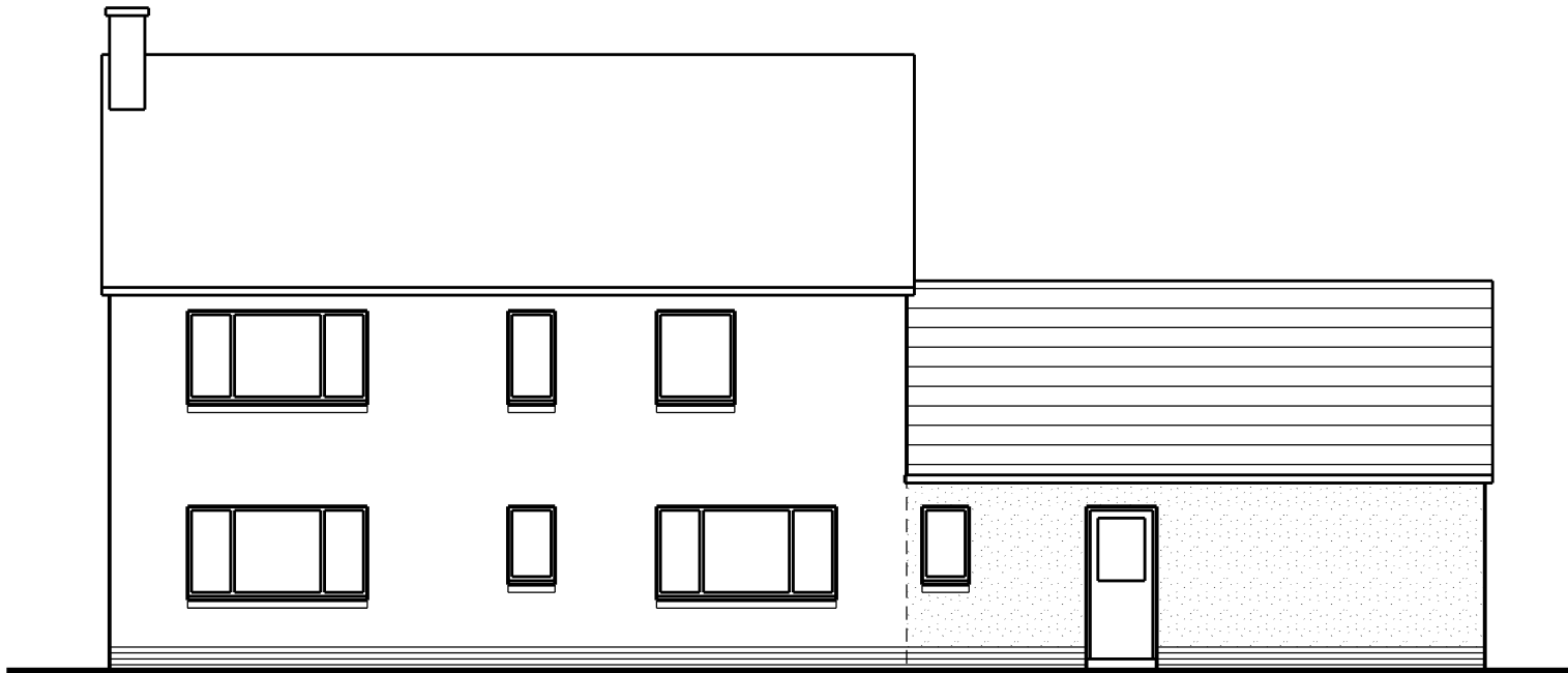
proposed rear elevation (west)