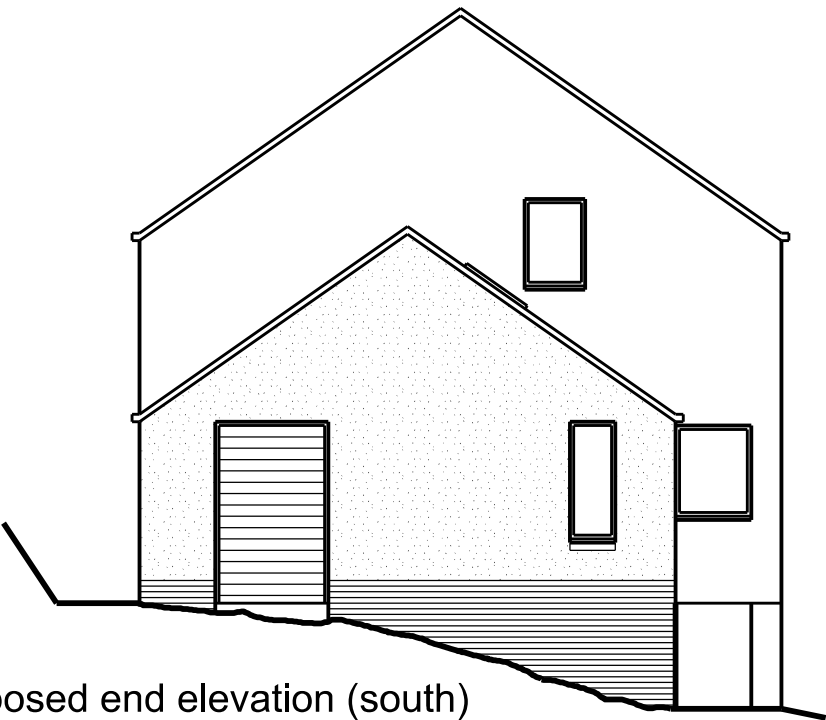
proposed end elevation (south)