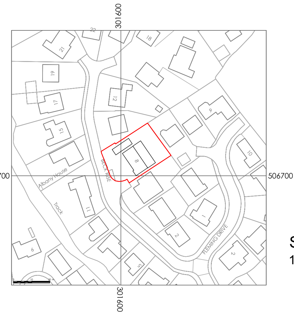
Site Location Plan 1:1250 scale