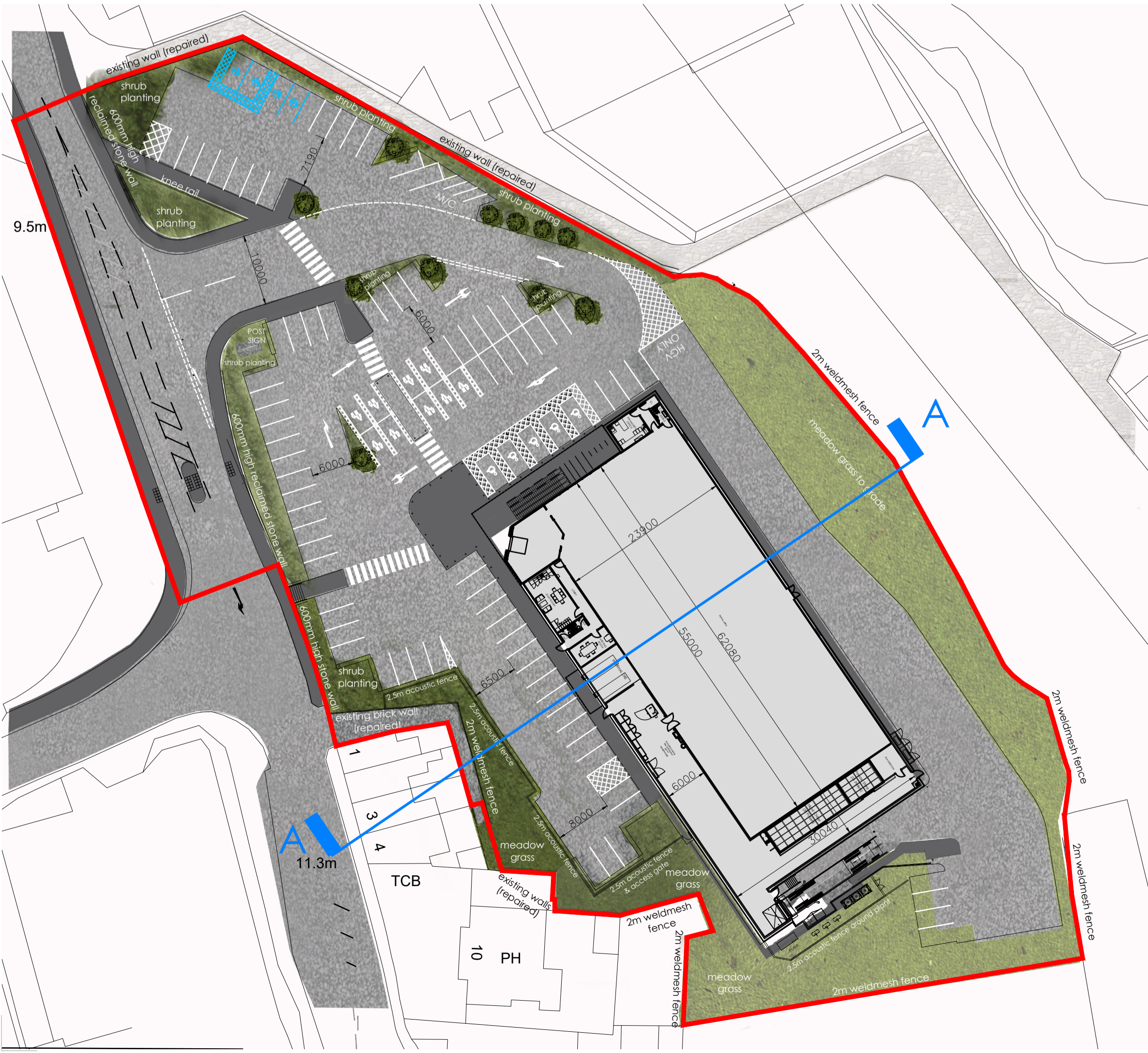
REFERENCE SITE PLAN 1:500