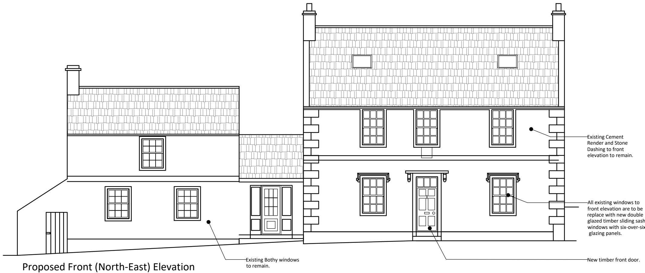
Proposed Front (North-East) Elevation