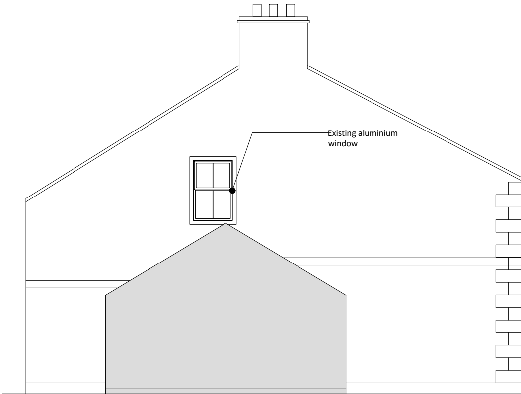
Existing Side (South-East) Elevation with Bothy Omitted