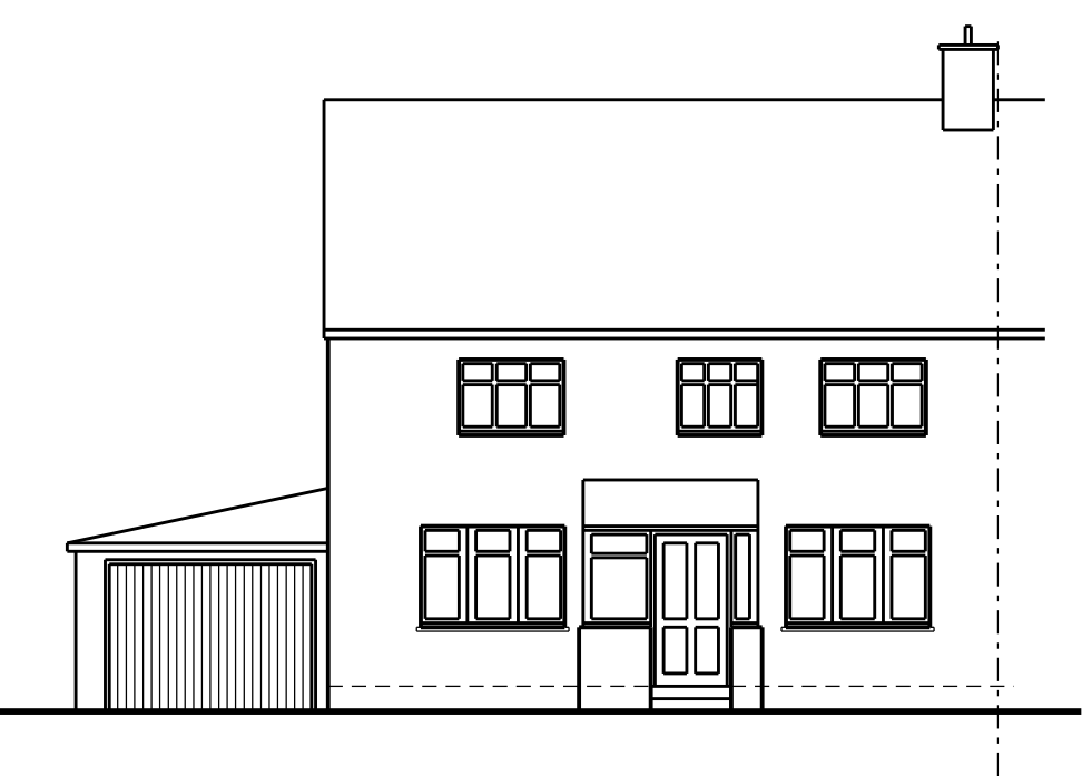
existing front elevation (NW)