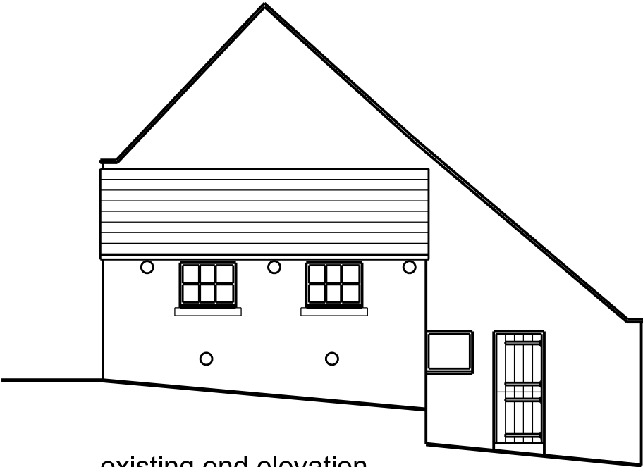
existing end elevation