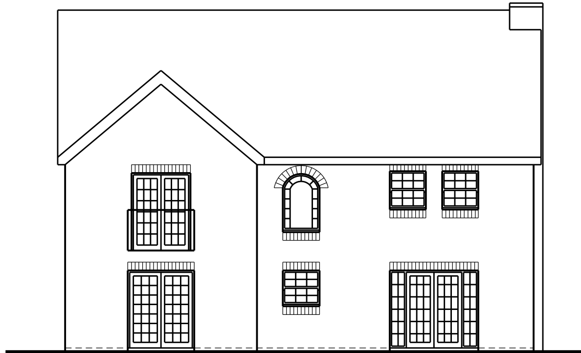
existing rear elevation (SW)