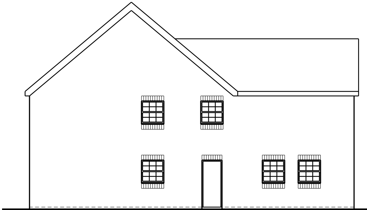
existing side elevation (NW)