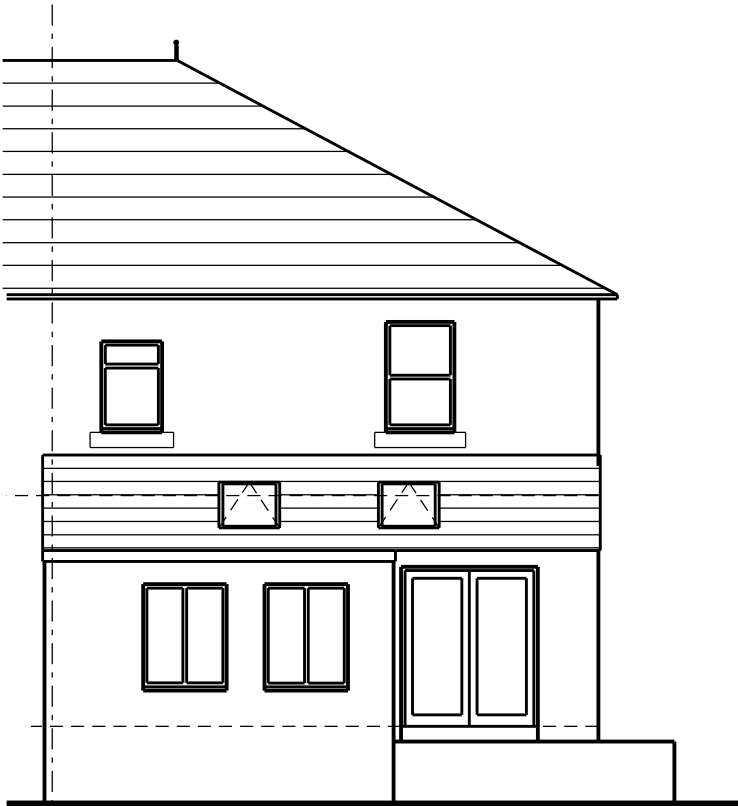
existing rear elevation (NW)