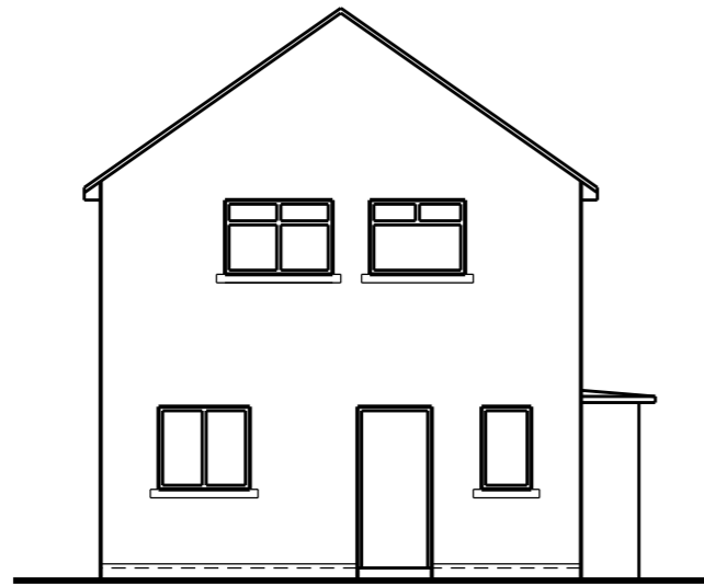
existing end elevation