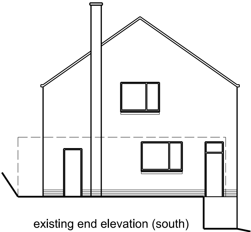
existing end elevation (south)