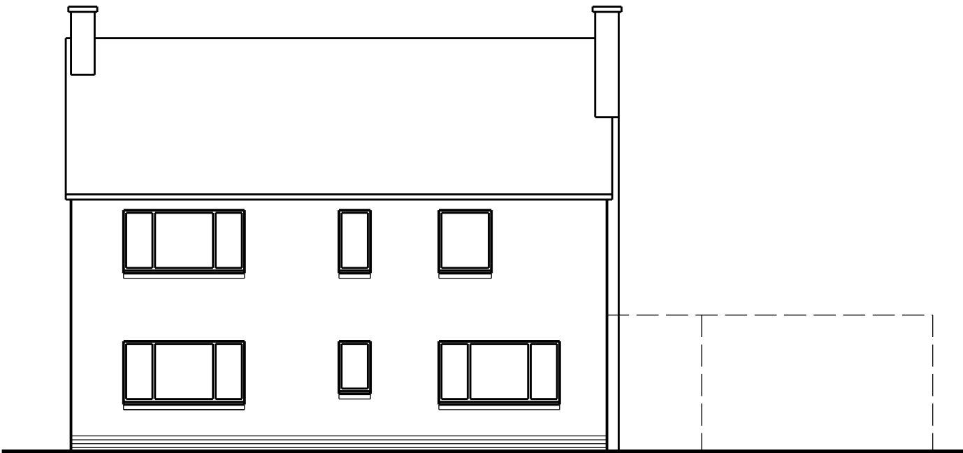
existing rear elevation (west)